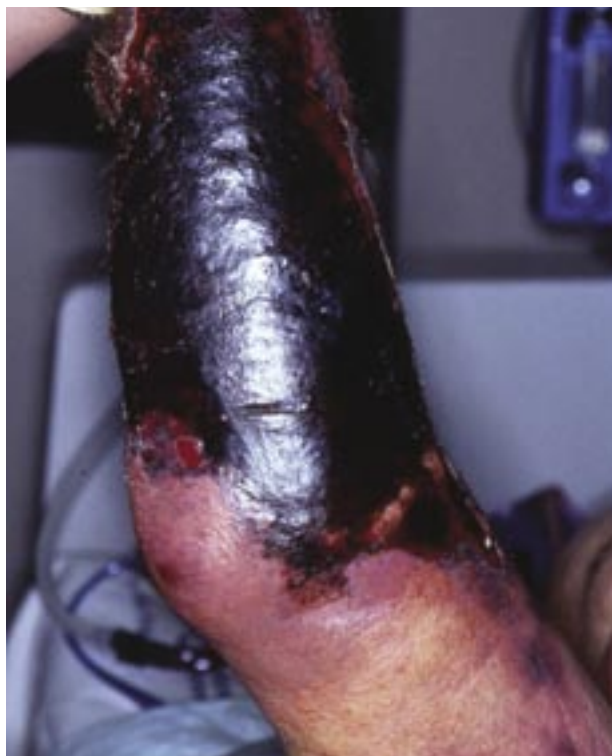
Figure 1. Necrotic plaque on the patient's arm.

Results from a punch biopsy specimen showed numerous organisms in macrophages on hematoxylin and eosin staining (Figure 3). Periodic acid-Schiff stain revealed hundreds of yeast forms and cigar-shaped bodies (Figure 4). The tissue fungal culture grew Sporothrix schenckii . The patient was treated with intravenous amphotericin B. He developed renal failure and died 3 days later.