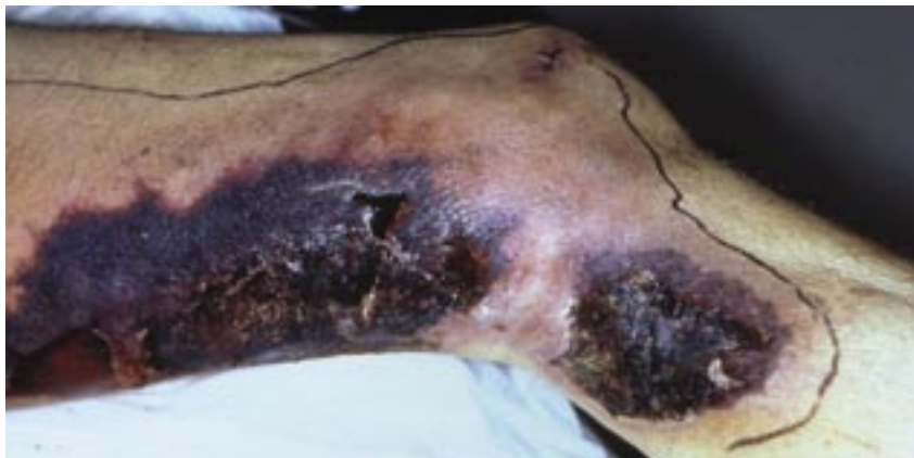
Figure 2. Necrotic plaque with surrounding erythema on the patient's leg.

Extracutaneous (systemic) forms of S schenckii are rare and may be asymptomatic, unifocal, or multifocal. Virtually any organ system can be affected. Unifocal extracutaneous sporotrichosis most often affects the skeletal, pulmonary, or genitourinary systems. Joint involvement is the most frequent extracutaneous finding. 4 Multifocal disease may occur via direct spread from a cutaneous source or hematogenous seeding, or from a primary pulmonary source. Interestingly, pulmonary involvement in multifocal disease appears as linear and nodular infiltrates on chest film, while cavitary nodules more commonly are found in primary pulmonary sporotrichosis. Most