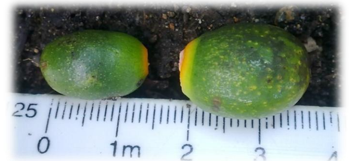
Fruits of: Izq.: Ocotea sp. Der: Ocotea tonduzii

The family Lauraceae (aguacatillos) includes about 75 species in the Monteverde area, and is one of the most important plant species in the Cloud Forest, as they feed a lot of wildlife, including some endangered species, such as the Quetzal (Resplendent), the Pajaro Campana ( Procnias tricarunculata ), Spider Monkeys ( Ateles geoffroyi ), among others. Some of the possible species observed in the trails of the Santa Elena Cloud Forest Reserve are: Ocotea , Ocotea tonduzii , Beilschmiedia among others.