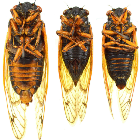
Magicicada septendecim (Linnaeus, 1758)