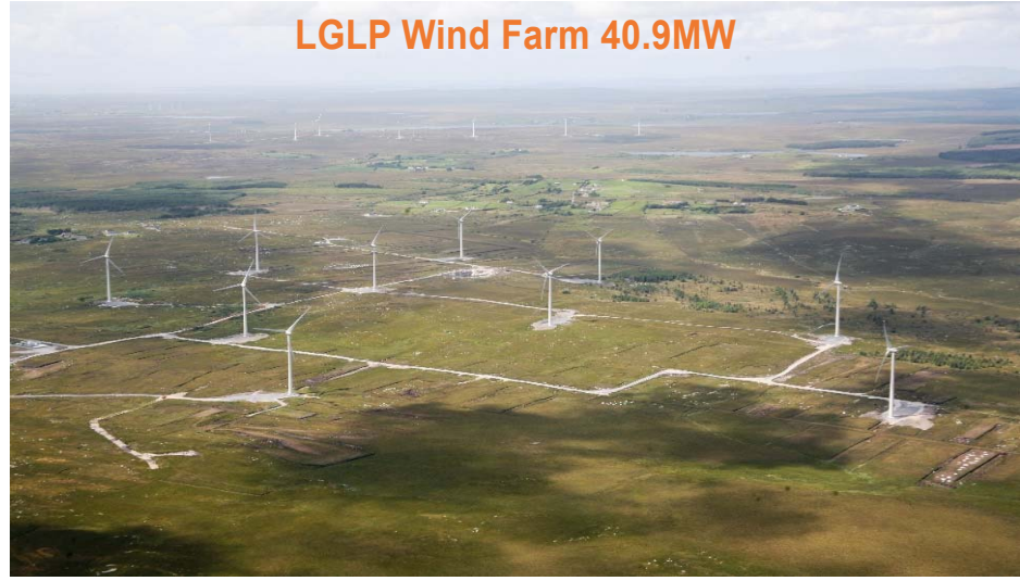
LGLP Wind Farm 40.9MW

Ireland imported 66% of its energy requirement in 2017, one of the highest ratios in Europe. The more of its own energy Ireland can produce, the less vulnerable it would be to foreign policy and conflict interrupting gas, oil and electricity supply lines. There is an opportunity to continue developing a strong indigenous wind industry, that will take advantage of Ireland's excellent wind resource, reducing our import dependency.