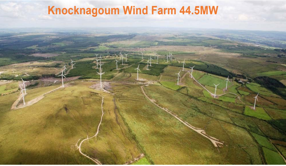
Knocknagoum Wind Farm 44.5MW