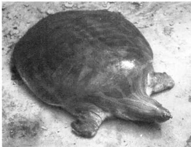
Figure 3. A Chitra vandijki in Myinthar-Kyarnyut Village, 10 March 2001. The turtle was captured by fishermen in the Ayeyarwady River a short distance upstream at Khayansat Kone Village.

Chitra vandijki . — The existence of a species of narrow-headed softshell in the Ayeyarwady River has long been suspected (Iverson, 1992; van Dijk, 1993; McCord and Pritchard, 2002), but not verified until recently. On 10 March 2001 we examined a living (CL = 408 mm; weight = 5.6 kg) narrow-headed softshell in Myinthar-Kyarnyut Village along the Ayeyarwady River (Fig. 3). The turtle was collected a short distance upstream at Khayansat Kone Village several days prior to our visit. According to the