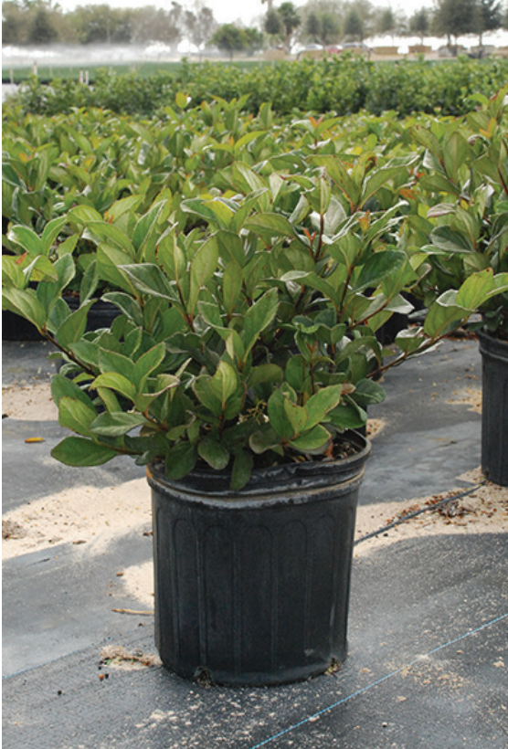
3g Viburnum Suspensum

Viburnum Suspensum, also known as Sandankwa Viburnum, is a dense evergreen shrub. Native to Japan, this shrub flourishes in areas with mild winters. Its foliage is leathery and coarse, with broad oval leaves. Viburnum Suspensum grow densely and regularly reach between ten and twelve feet in both height and spread.