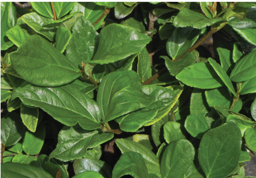
Viburnum Suspensum leaves

Due to their height and density, Viburnum Suspensum make ideal choices for privacy screens, while their dark green, lustrous foliage makes them perfect candidates to serve as a backdrop for vibrant focal plants.