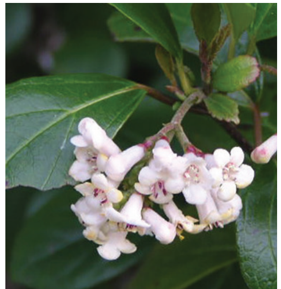
Viburnum Suspensum flowers