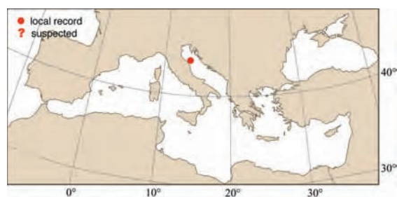
1st Mediterranean record Central Adriatic Sea, 1979 [1977]