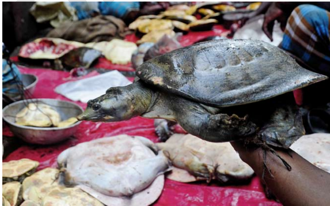
A wild caught Indian Peacock Softshell Turtle Nilssonina hurum awaiting sale in a market in central Dhaka, Bangladesh. In the background are various species of the Indian Flapshell Turtle Lissemys sp.