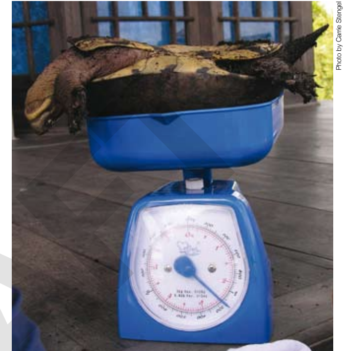
Malayan Box Turtle Cuora amboinensis being weighed for sale in Jakarta, Indonesia.

All participants will work with their national CITES Management Authority to propose uplistings relevant to their country and support them through the provision of appropriate scientific data.