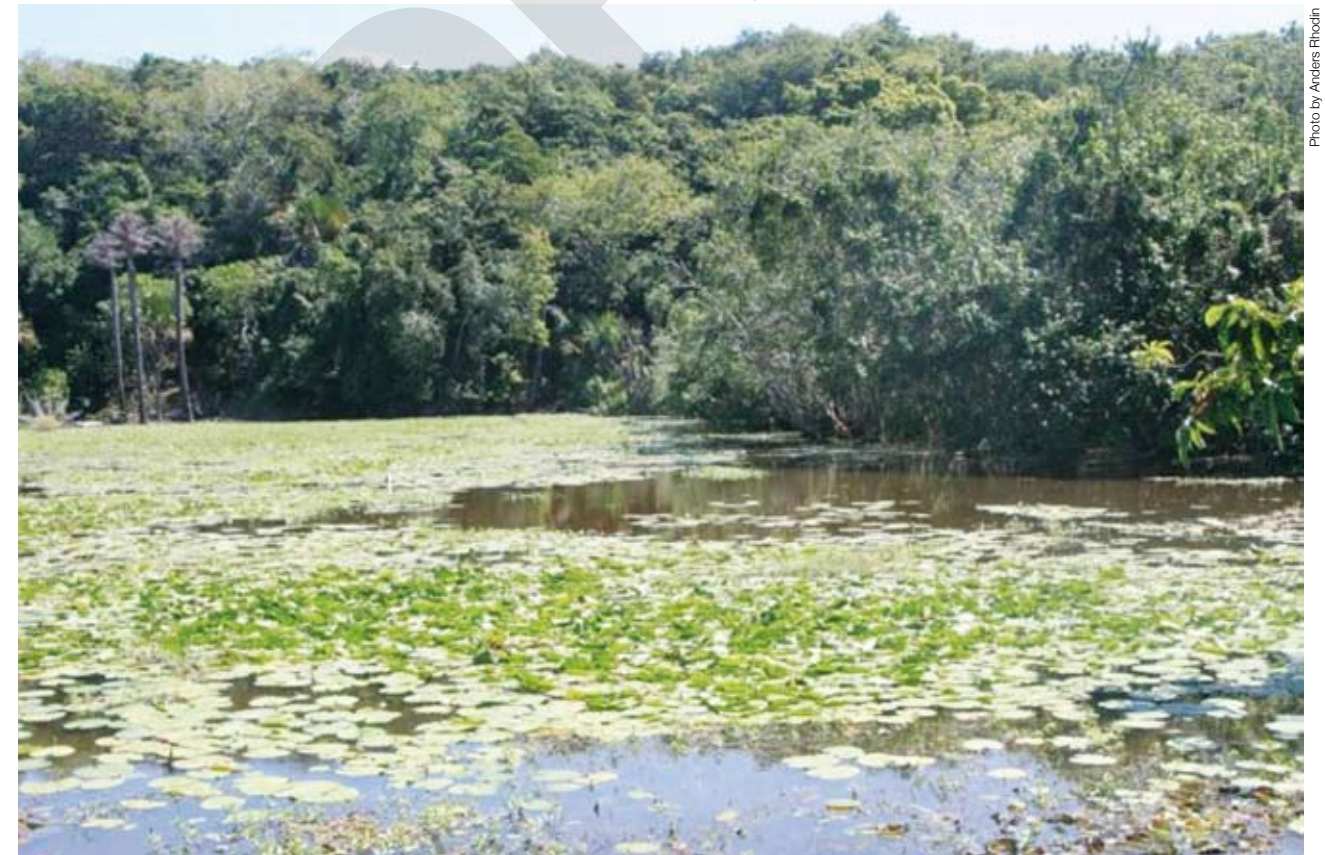
Large amounts of the original habitat for Roti Island Snake-necked Turtle Chelodina mccordi still remains relatively intact, making re-introduction projects for this species feasible.