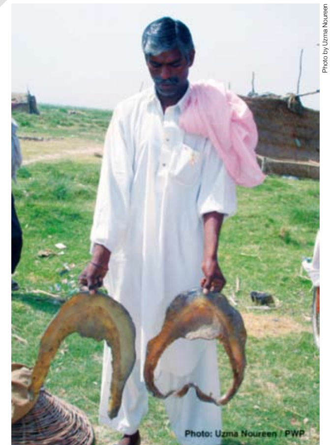
Calipee from a large South Asian Softshell Turtle Nilssonina sp. being dried along the Indus River of Pakistan in preparation for its sale and eventual export to China.