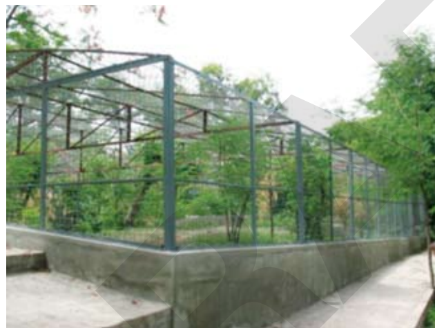
The use of in-range captive breeding facilities for Burmese Star Tortoise Geochelone platynota will play an important role in the re-establishment of wild populations of these tortoises in Myanmar.

Regional training workshops and exchanges need to be conducted and best practice manuals created by NGO's such as TSA, WCS, and WRS in conjunction with members of the Tortoise and Freshwater Specialist Group to ensure proper in-depth planning and operation of rescue centers. Existing materials from KFBG could be adapted for such use.