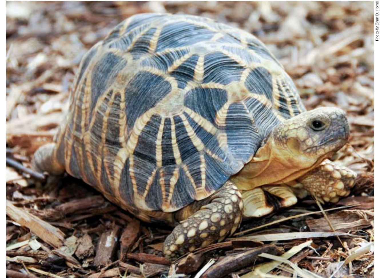
Burmese Star Tortoise Geochelone platynota , functionally extinct in the wild, is at a turning point of its conservation. Preparations are underway to begin re-introducing captive bred juveniles into protect habitats within Myanmar's central dry zone.

Meetings of the region's turtle experts and conservation practitioners should occur at no greater than five-year intervals.