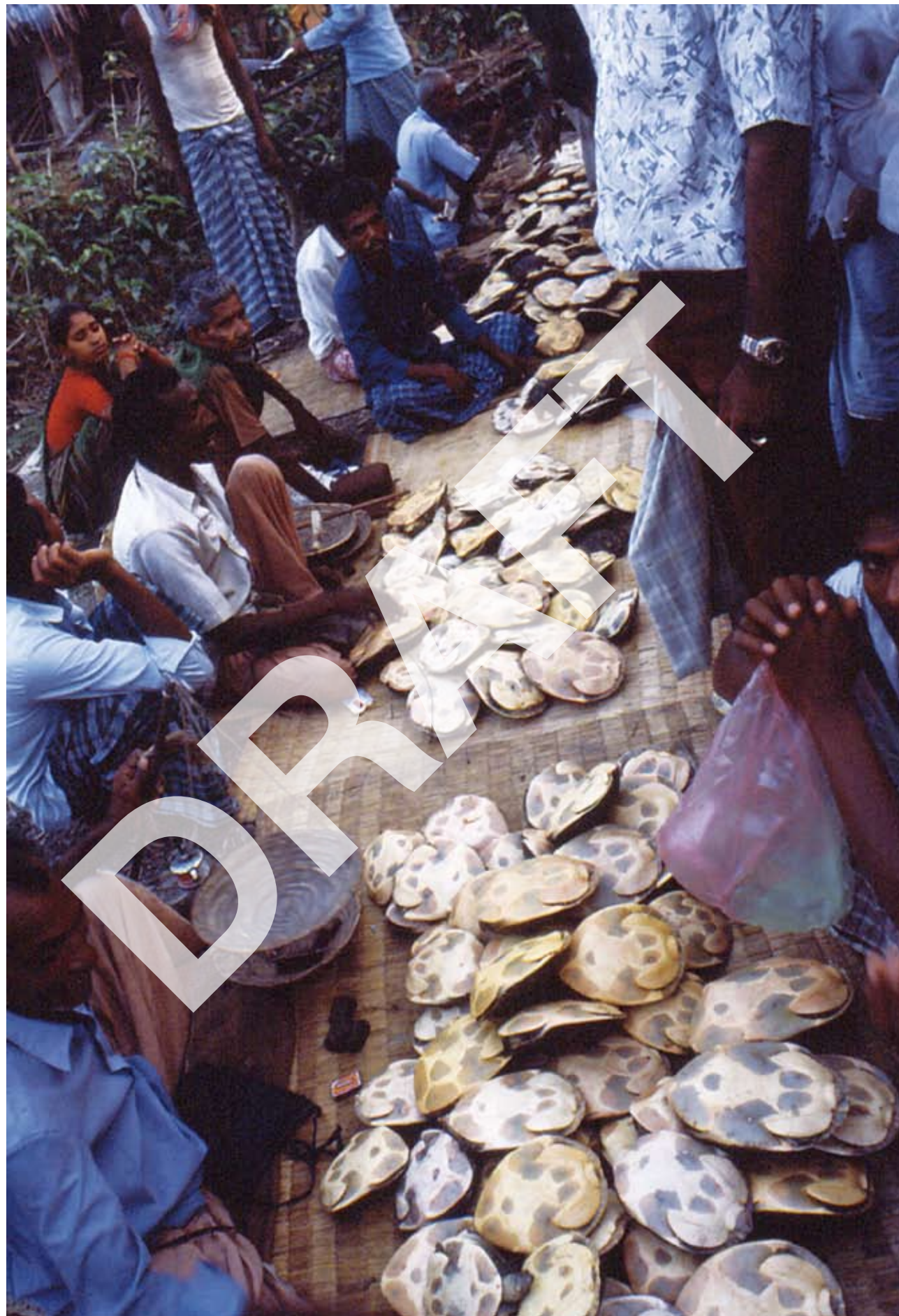
Turtles for sale in the open markets of Dhaka, Bangladesh.