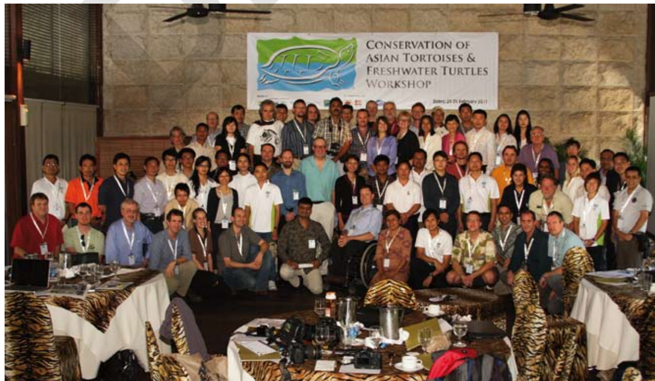
Conservation of Asian Tortoises and Freshwater Turtles: Setting Priorities for the Next Ten Years