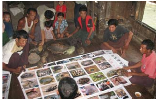
Local education, here in northern Myanmar, is critical to reducing the threats of wild turtle populations.