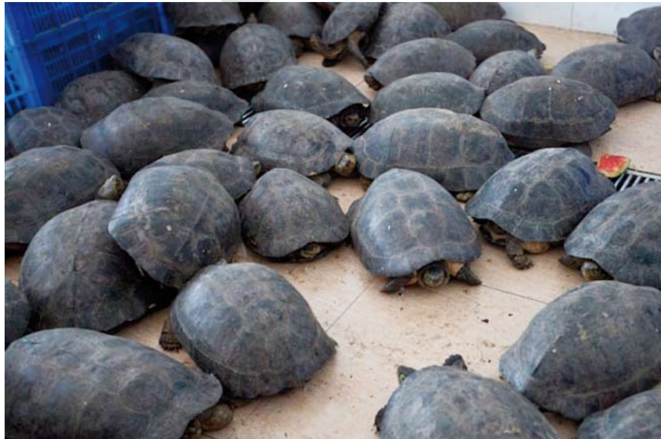
Yellow-headed Temple Turtle Heosemys annandalii is highly sought after and often appears in shockingly large numbers in the food markets of China. Populations of these large river turtles cannot possibly sustain this high level of exploitation.

Government, academic, and/or NGO conservationists should initiate field research including distribution and population estimates and the impact of trade for these species lacking enough data to determine population status. Additionally, appropriate reference materials need to be developed in relevant languages to avoid confusing species identification.