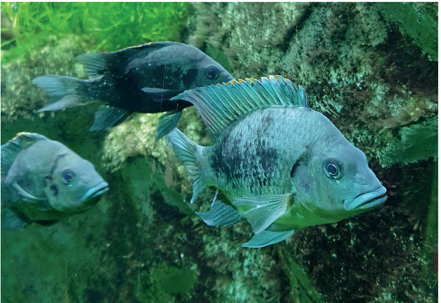
Ptychochromis oligacanthus in the aquarium of Cologne Zoo | Thomas Ziegler

Within its very limited range, Ptychochromis oligacanthus is not rare, but the long-term survival of the species in the wild is threatened due to the factors mentioned above.