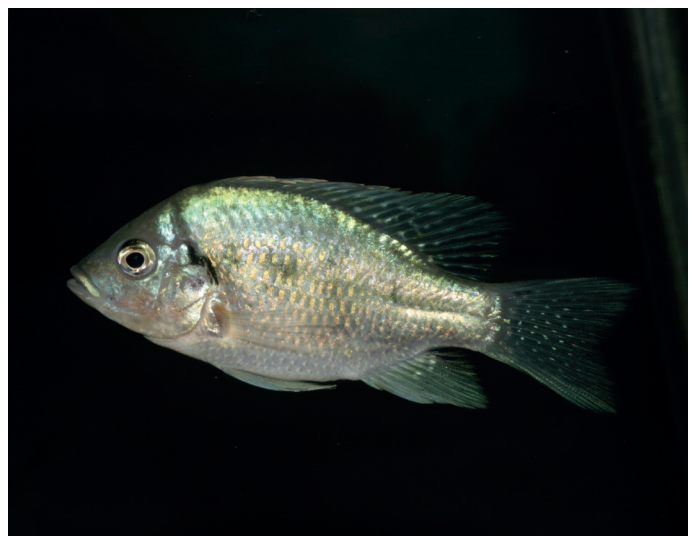
Typical for Ptychochromis oligacanthus are the scattered dark spots on the side. These can be variably pronounced, as in these silvery shiny individuals of medium size. | Thomas Ziegler