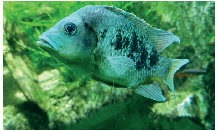
An adult with gray-blue scales and distinct dark spots | Thomas Ziegler