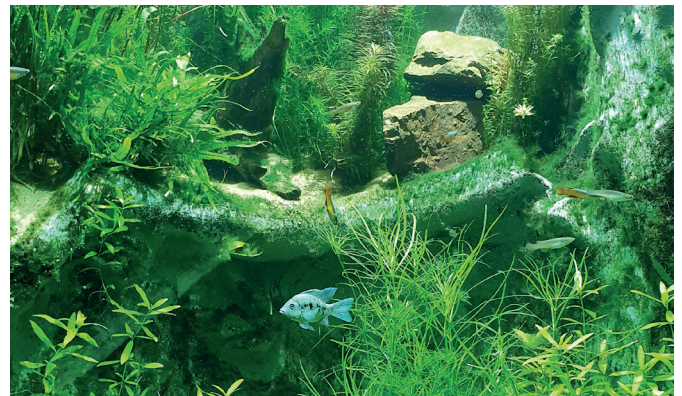
The aquarium of Ptychochromis oligacanthus in the Cologne Zoo is equipped with plenty of aquatic plants and other hiding places.

The filter equipment of the aquarium should be lush and ensured with external or mat filters. All aquarium water should pass through the filter at least four times per hour to ensure good water quality on a permanent basis.