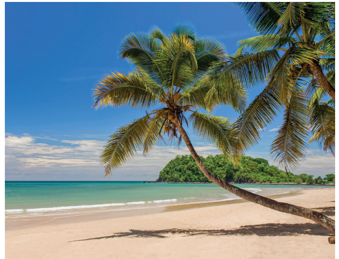
On the island of Nosy Be, populations of Ptychochromis oligacanthus are still largely intact.

Populations and habitats on the island of Nosy Be are still largely intact, but the threat of invasive species competing for habitat and food and acting as predators are a constant potential threat and can contribute to the local disappearance of local populations at any time. Populations on Madagascar itself are already threatened by overfishing, habitat loss, and the spread of invasive species, which may also lead to local extinction events in individual lakes and rivers in the future.