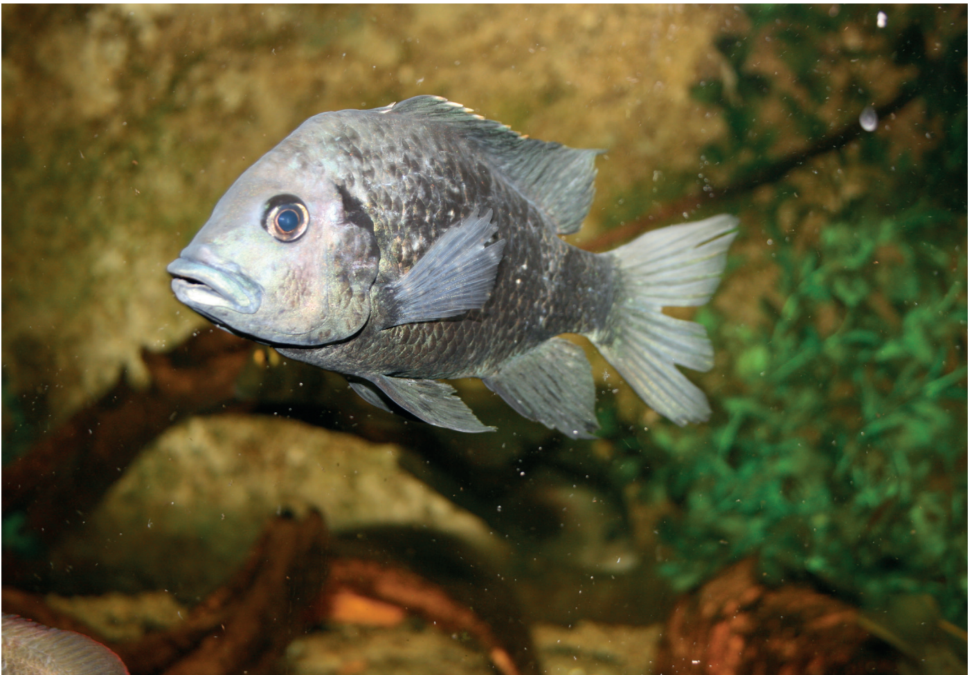
Nosy Be Cichlid in a private keeper's tank | Piotr Korzeniowski

Therefore, it is recommended to keep the fish in larger groups and to equip the aquarium with only few furnishings. In this way, the animals are in constant social interaction and permanently defend their small territories. Individuals are thus not too strongly suppressed.