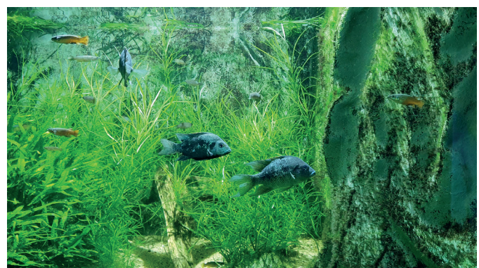
Nosy Be cichlids are kept in the visitor area of the Cologne Zoo together with Pachypanchax sakaramyi, which also originate from Madagascar.