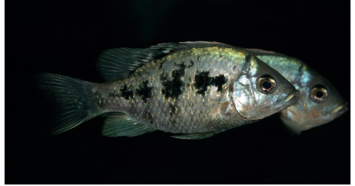
Two Nosy Be cichlids of medium size | Thomas Ziegler