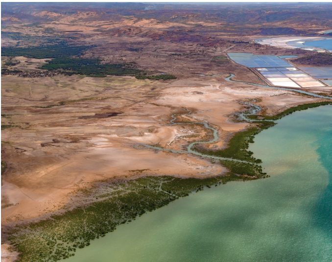
Deforestation leads to soil erosion and consequent input of suspended sediment into water bodies that serve as habitat for Ptychochromis oligacanthus .

This leads to severe soil erosion and an influx of suspended matter into the rivers and lakes, which has a negative impact on the habitat parameters of the fish. (BENSTEAD et al. 2003; RAVELOMANANA & SPARKS 2020).