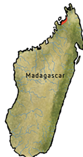
The distribution range of Ptychochromis oligacanthus on the main island and the offshore island Nosy Be