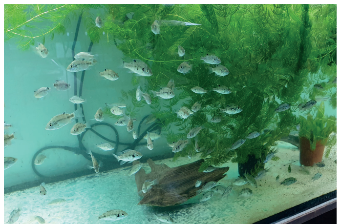
Juvenile schools of several dozen individuals are possible. | Thomas Ziegler

Several days pass until the larvae hatch. The hatched larvae and fry are maintained at identical water values as the adults. Juvenile schools of several dozen individuals are possible. Further rearing usually proceeds without problems.