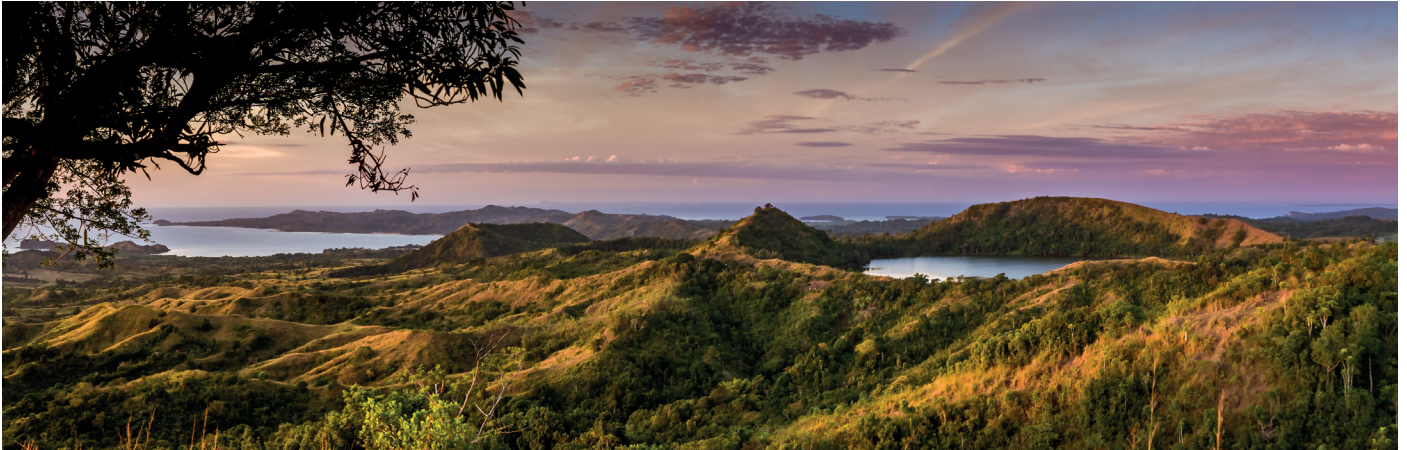
View over the north of Madagascar with Nosy Be island in the background

The total range of Ptychochromis oligacanthus is very small, with about 3,500 km 2 . The species occurs in freshwater lakes and rivers. The type locality is the crater lake Lac Ampombilava on the northeast offshore island Nosy Be (BLEEKER 1868).