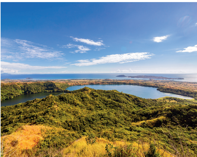
Crater lakes in northern Madagascar are part of the natural range of Ptychochromis oligacanthus .

The waters that are colonized on Nosy Be are mostly clear, and the habitats are still intact. In contrast, the rivers and lakes on the mainland are mostly turbid. This turbidity is due to the input of suspended sediment due to increased soil erosion caused by deforestation on the island.