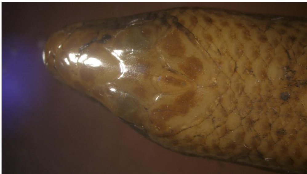
Figure 2. Lygosoma angeli (THNHM 11298 Xe Paine, Champasak, Laos): dorsal view of head. There was some staining done for scale counts.