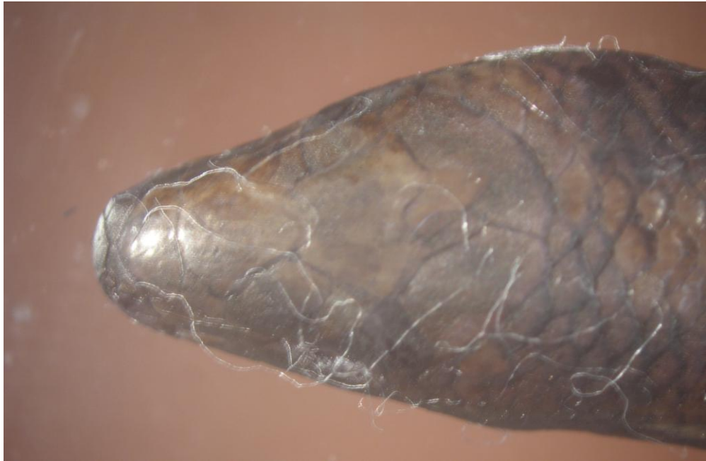
Figure 1. Lygosoma angeli (THNHM 07070 Khao Soi Dao Wildlife Sanctuary, Chantaburi Province, Thailand): dorsal view of head.