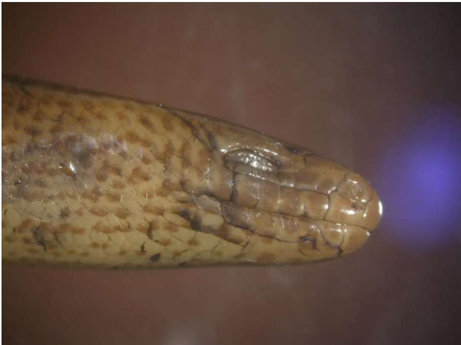
Figure 4. Lygosoma angeli (THNHM 11298, Xe Paine, Champasak, Laos): lateral view of head.