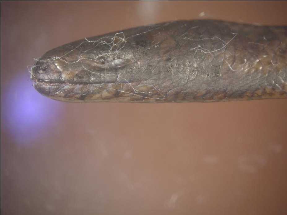
Figure 3. Lygosoma angeli (THNHM 07070, Khao Soi Dao Wildlife Sanctuary, Chantaburi Province, Thailand): lateral view of head, stained for scale counts. Fibers are from an attempt to clean the specimen.