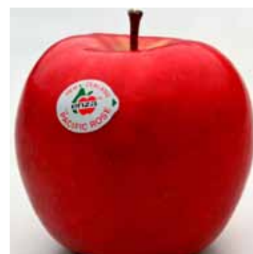
Sciros* (Pacific Rose®)