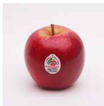
Scired* (Pacific Queen®)

Late season blushed apple with pink-red colour and sweet, crisp flesh. Royalty: $1.75/tree