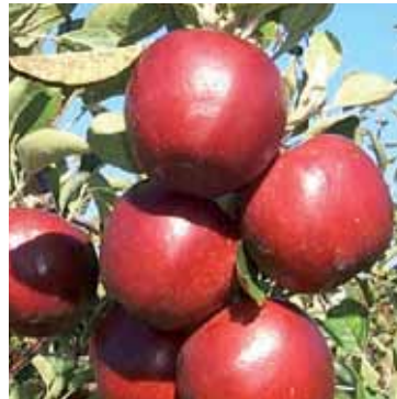
Redfield* (Mahana Red®)