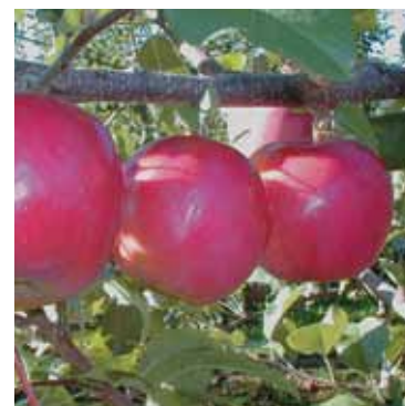
September Wonder® (Fiero)