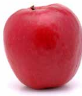
Lady in Red*

A high colour mutation of Cripps Pink that will achieve stronger early colour. The same bright pink blush of Cripps Pink with underlying stripes. Royalty: $3.00/tree