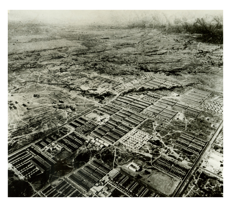
Figure 4. Aerial view of two sectors in Islamabad (G6-1 & G6-2).