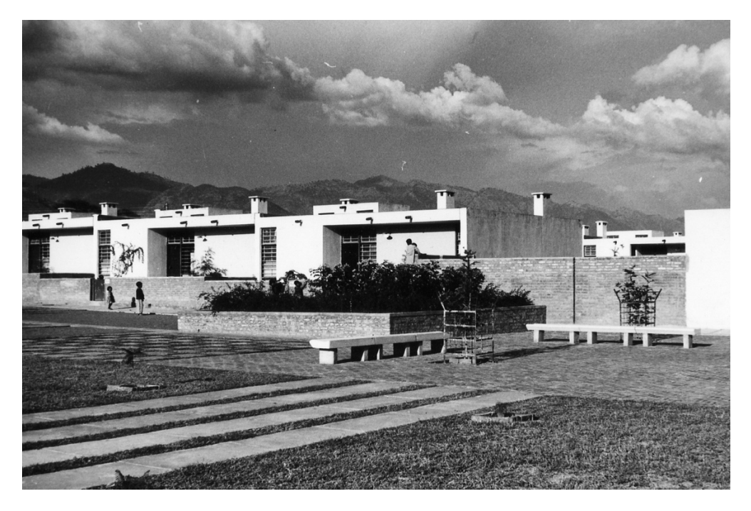
Figure 3. Aspect of a neighbourhood's centre in Islamabad.