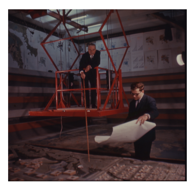
Figure 2. Constantinos Doxiadis inspecting a model of Islamabad at his office premises in Athens.