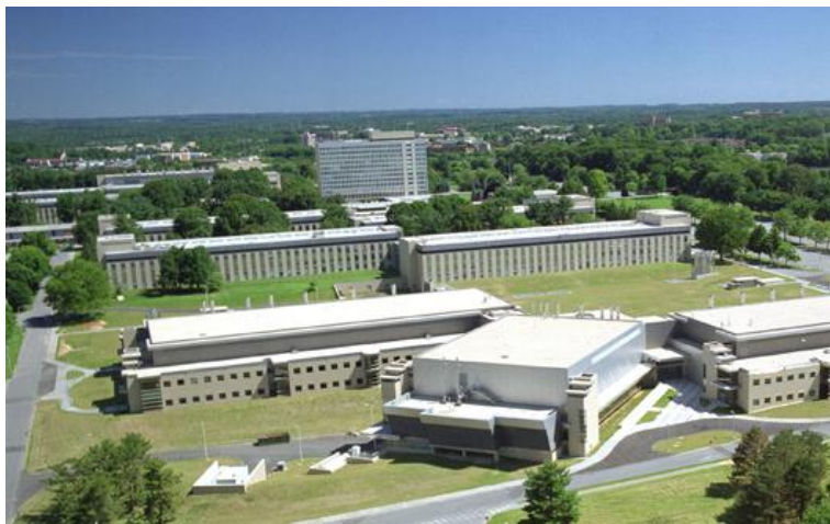
Fig.1 Center for Neutron Research (CNR) at NIST