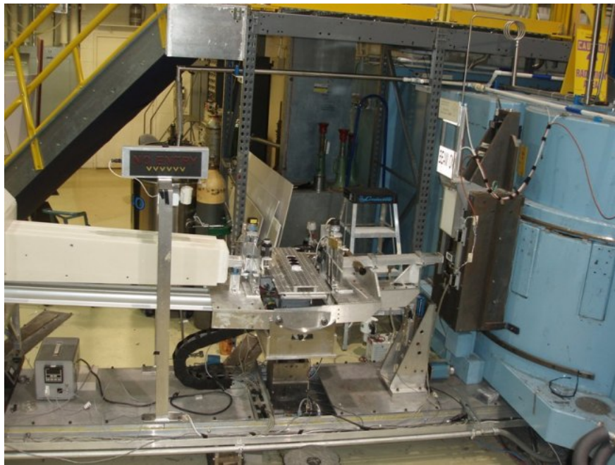
Fig. 2 NG7 SANS (Small Angle Neutron Scattering) beam

Dr. Tao's team used the NG7 SANS (Small Angle Neutron Scattering) beam. The SANS device uses neutron reflectometry, a relatively new technique for investigating the near-surface structure of many materials.