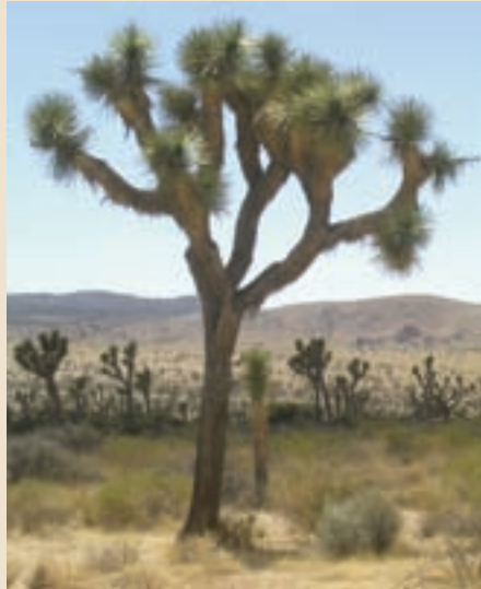
Joshua tree at the center of a magic circle.

In the evening against the silhouette of the rocky hills surrounding the valley and the colorful clouds, small pipistrellid bats darted overhead. The last notes of the thrasher were heard far away. As the sky grew darker, bringing out the stars, we looked beyond our Magic Circle to that larger circle, the rim of the horizon.