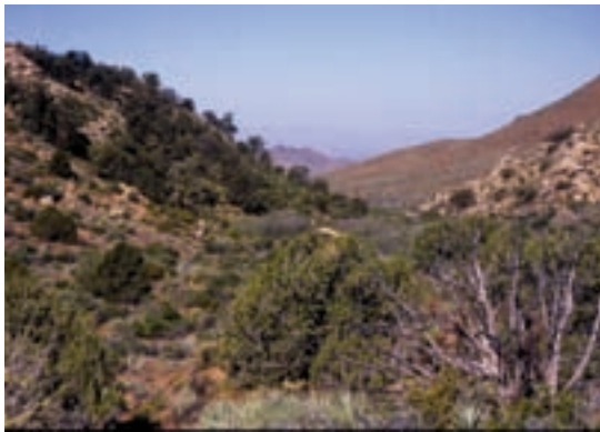
Macedonia Canyon, possibly used by Garcés to cross the Providence Mountains and reach the Mojave River.

Unlike his contemporaries, Garcés was able to communicate across boundaries of ignorance with respect and kindness. He also was ambitious, introducing native souls to sacraments and attempting to establish a land route from New Mexico to the fledgling missions of California. Required by the crown of Spain to keep a diario , Garcés recorded in detail the native people he encountered and the landscapes he traversed. He left the mission of San Xavier del Bac (near Tucson) in 1771, crossed the Colorado River at Yuma, headed south to avoid the Algodones Dunes, entered the Imperial Valley, and traveled far enough north to see the San Bernardino Mountains. Garcés had also accompanied Lieutenant-Colonel