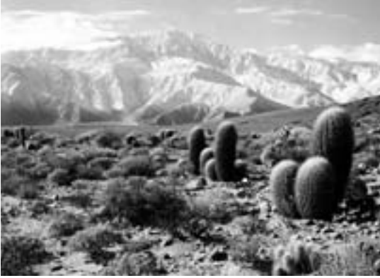
This cactus-rich view of Mount San Jacinto was named "Devil's Garden" in the 1930s. Note the steam train crossing the pass. (Stephen H. Willard)