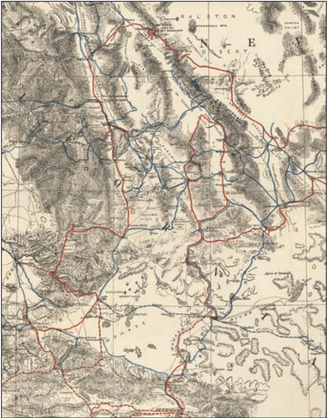
Route of the Death Valley Expedition led by C. Hart Merriam in 1891. (Fitch 1892.)