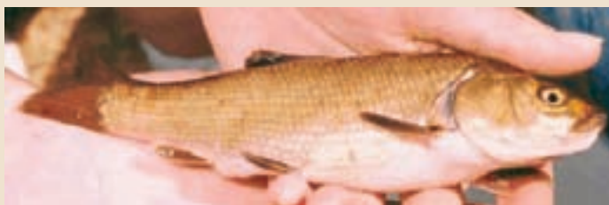
Mojave Tui Chub is the only native fish of the Mojave River. (Steve Parmenter)

remnant lakefish were historically found only in deep pools and sloughlike marshes that best resembled the ancient habitat.