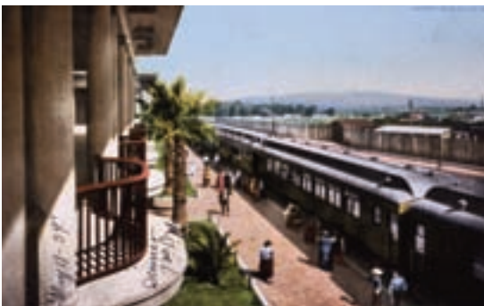
Postcard from the El Garcés Hotel along the Santa Fe Railroad at Needles.

Close to Needles live the remnants of the once powerful and warlike tribe of Indians, the Mojaves, now beggarly hangers-on to civilization, who love to congregate around the trains and offer their wares to passengers.