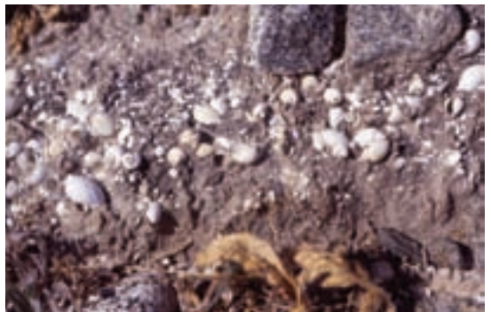
Upper The waterline of ancient Lake Cahuilla, on the west side of the Salton Trough. (Author)