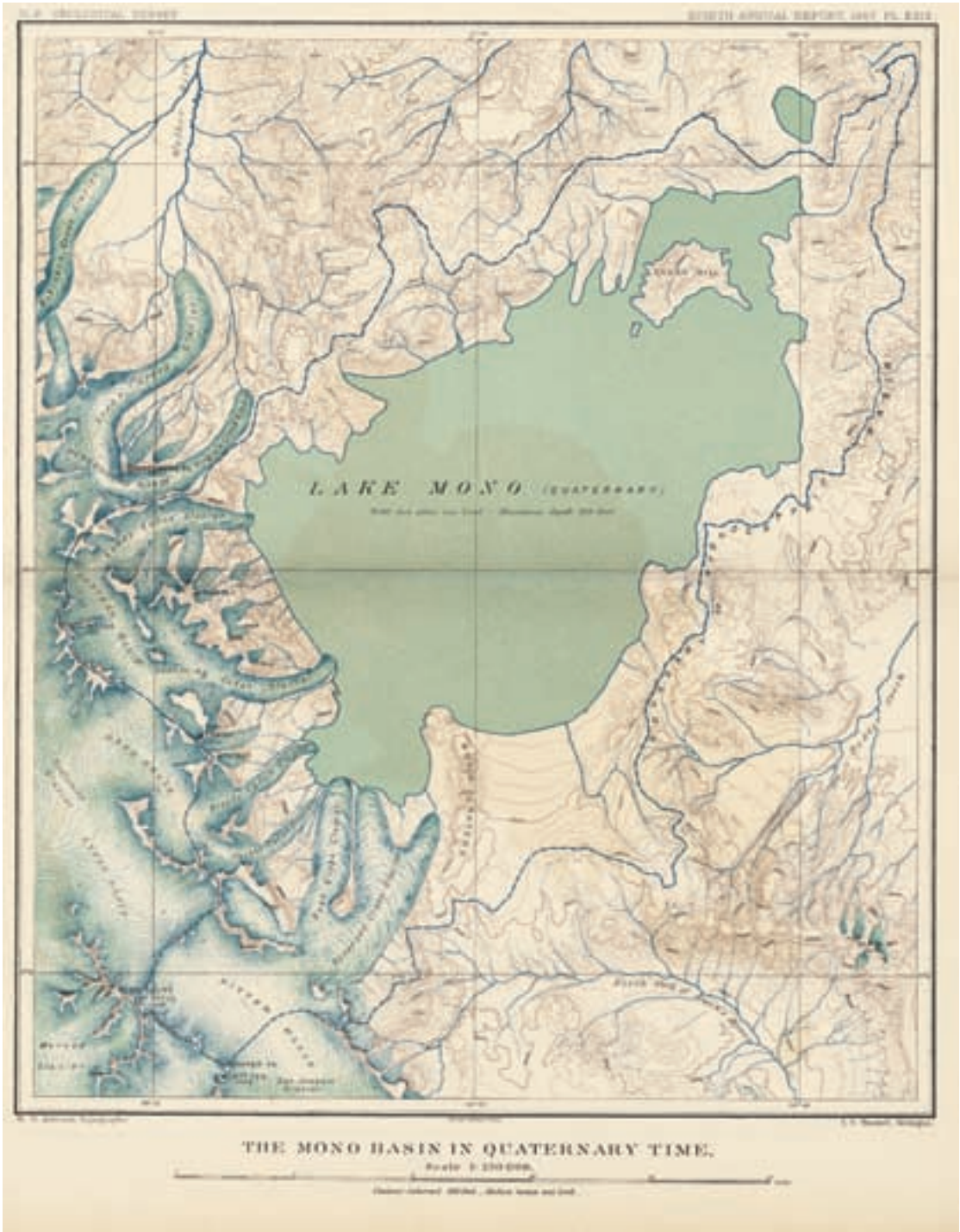
A map of the Pleistocene, showing Sierran glaciers and ancient Mono Lake (later named Lake Russell). (From Russell 1889.)