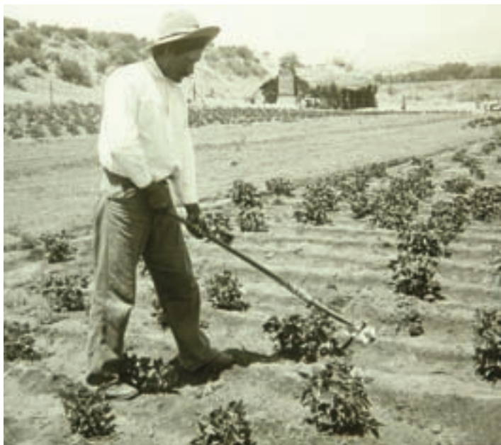
A Cahuilla man tends beans and transforms the Imperial Valley from desert into farm. (George W. James)

encountered by Garcés near Afton Canyon, had already been collected into missions between 1820 and 1834 and driven to extinction before the end of the century. Government subdivision of the “vacated” territory had begun in 1855, with the first European crops planted along the Mojave River in 1872.