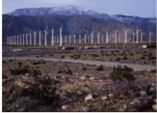
Similar view of Devil's Garden, 2006. The cacti were removed by collectors, the pass filled with highways and windmills, and the vegetation invaded by weeds.

corn and squash, and strips of jerky hanging on a string. There is a breed of desert men, not hiding exactly but gone to sanctuary from the sins of confusion.