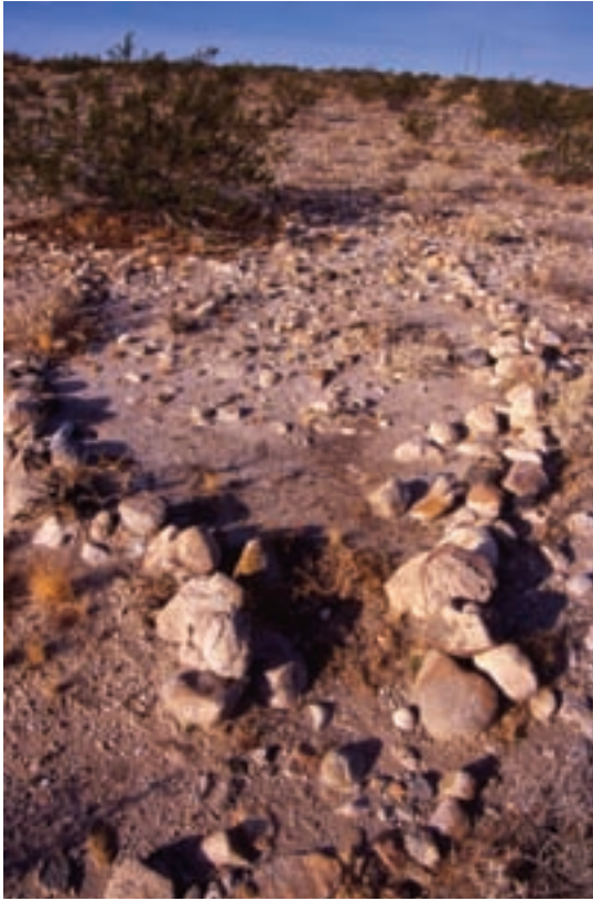
Fish traps precisely mark the shoreline of ancient Lake Cahuilla where it is now desert scrub.

the object of our visit, and appeared much pleased. When questioned about the shore-line and water marks of the ancient lake, the chief gave an account of a tradition they have of a great water ( agua grande ) which covered the whole valley and was filled with fine fish. There was also plenty of geese and ducks. Their fathers lived in the mountains and used to come down to the lake to fish and hunt. The water gradually subsided " poco a poco " (little by little) and their villages were moved down from the mountains, into the valley it had left. They also said that the waters once returned very suddenly and overwhelmed many of the people and drove the rest back to the mountains.