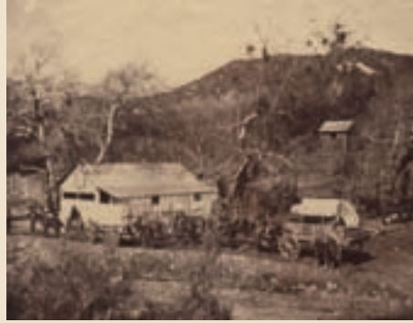
Beginning a desert journey at Cajon Pass Tollhouse along the Government Road, 1863.

Lay over to-day to rest the horses and finish the Redoubt. Had it finished so that a small party of men can hold it securely against any number of Indians