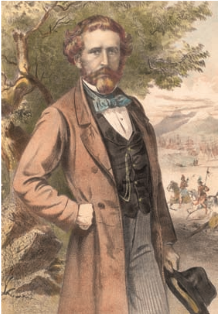
John C. Frémont, explorer, botanist, territorial governor, and presidential candidate.

continued our beautiful road, and reached a spring in the slope, at the foot of the ridge, running in a green ravine, among granite boulders; here nightshade, and borders of buckwheat, with their white blossoms around the granite rocks, attracted our notice as familiar plants. Several antelopes were seen among the hills, and some large hares. . . .