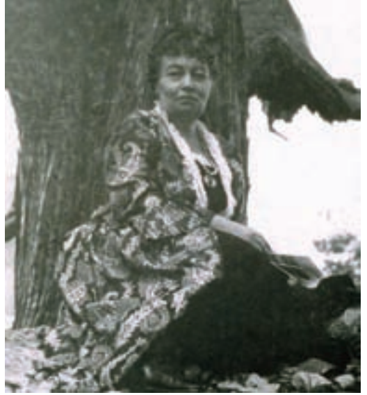
Mary Austin invited America back into the desert by providing a counterpoint to the stories of the '49ers.