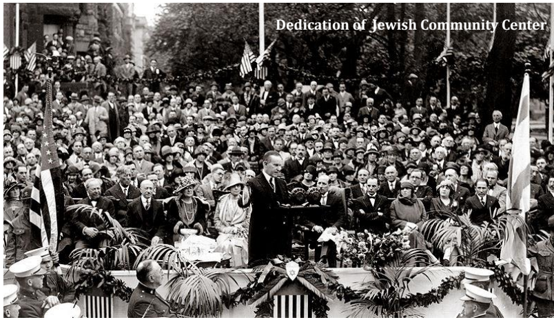
Dedication of Jewish Community Center