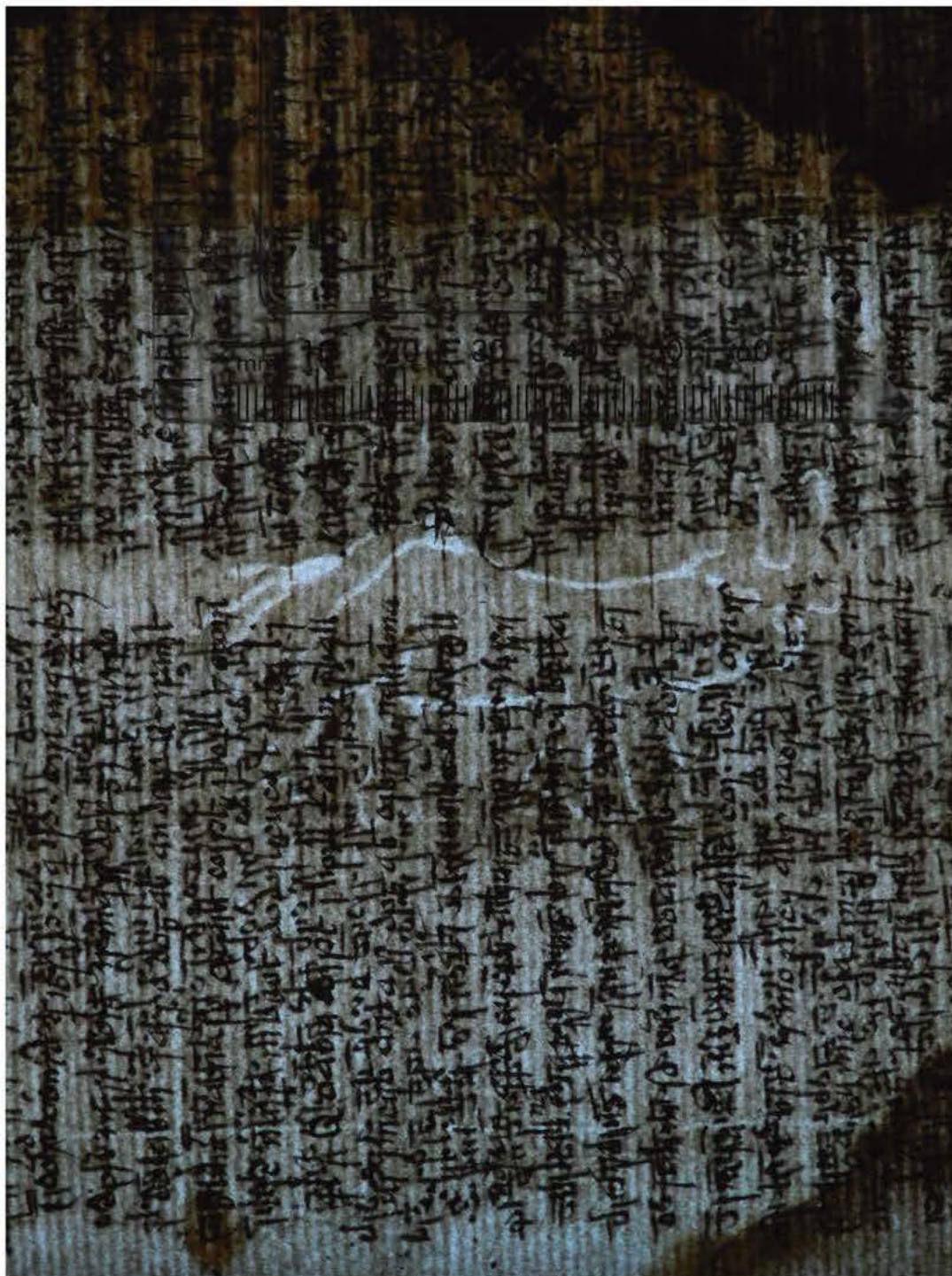
Fig. 2. Watermark from RIA MS 24 P 15, pp 31–2.