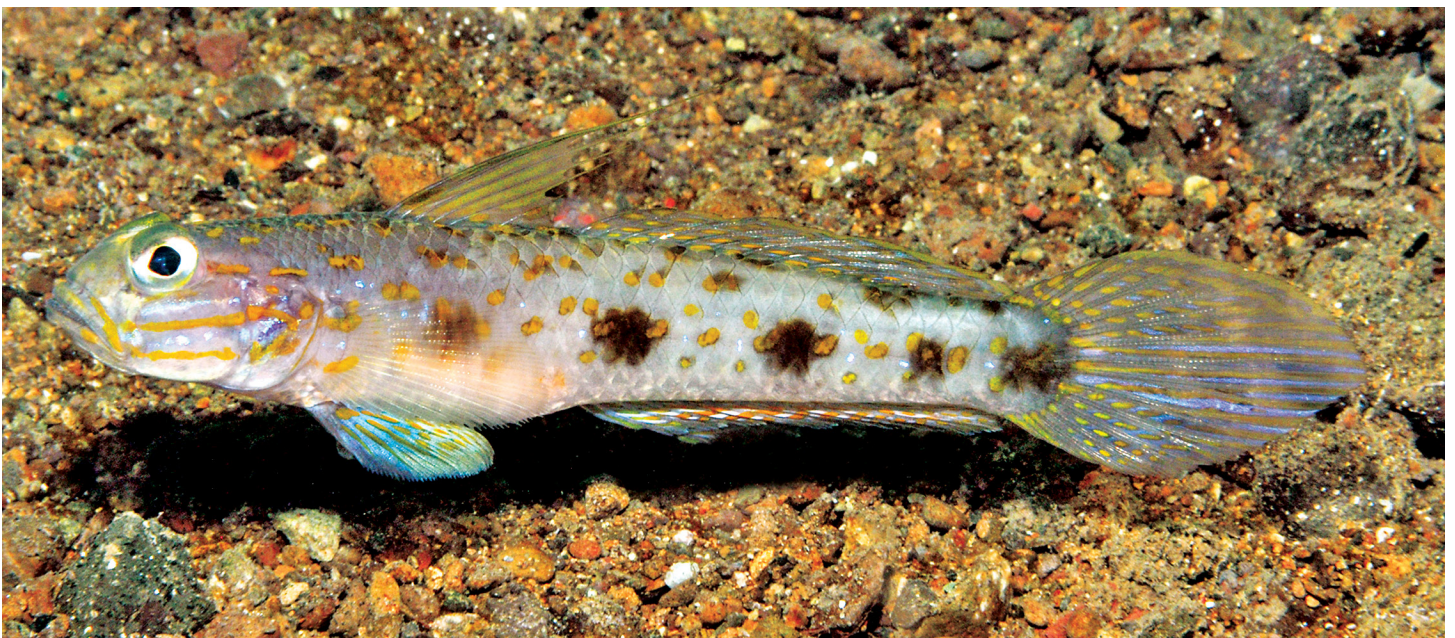
Figure 4. Acentrogobius vanderloosi , underwater photograph of freshly collected specimen, 73.7 mm SL, Batanta Island, West Papua Province, Indonesia (G.R. Allen).