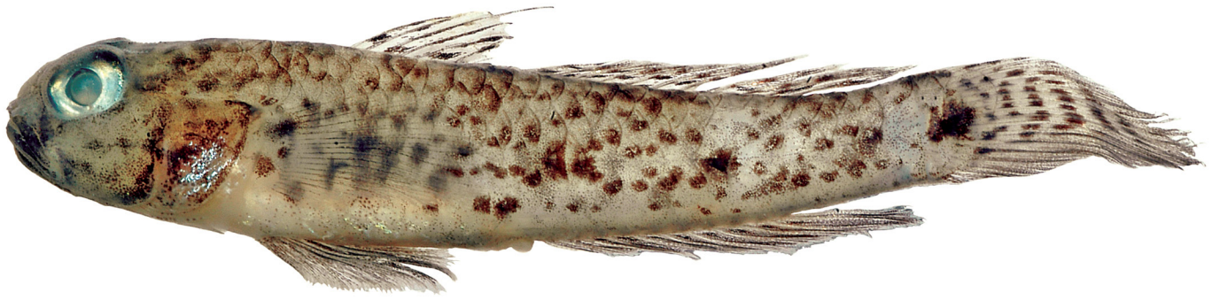
Figure 1. Acentrogobius limarius , preserved holotype, MZB 22708, female, 33.8 mm SL, Batanta Island, West Papua Province, Indonesia.