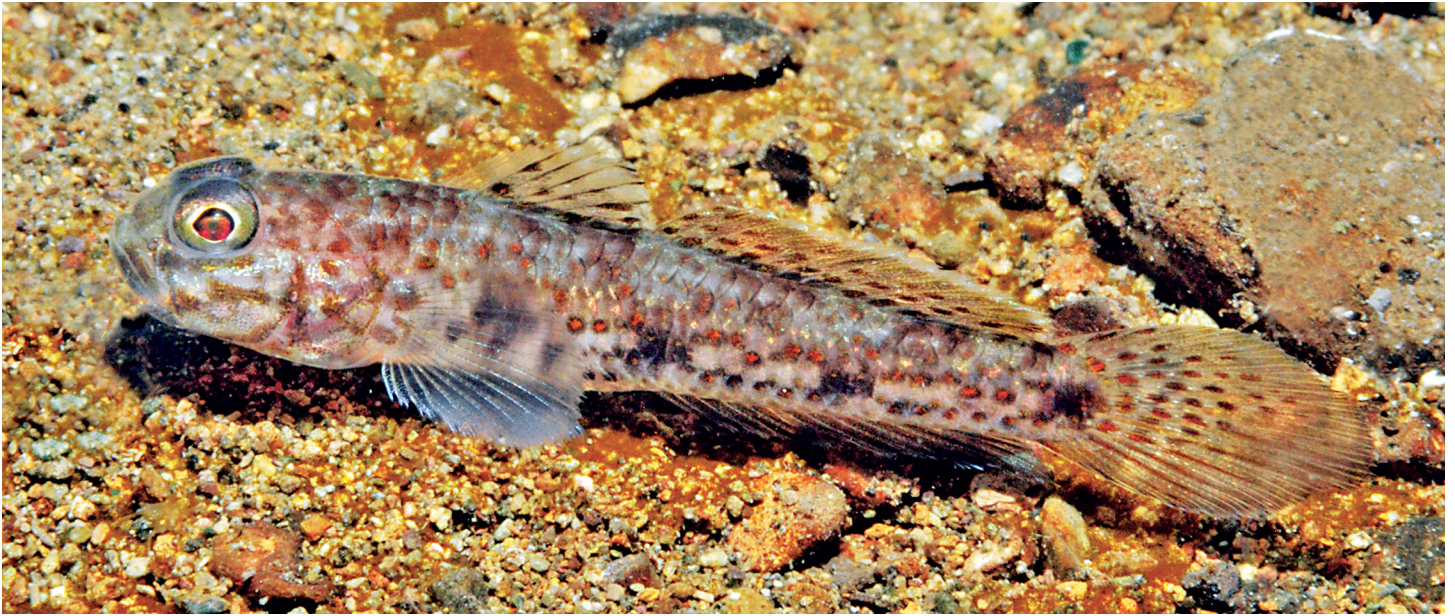
Figure 2. Acentrogobius limarius , underwater photograph, holotype, MZB 22708, female, 33.8 mm SL, Batanta Island, West Papua Province, Indonesia (G.R. Allen).

distance between snout and origin of first dorsal fin 2.7 (2.5–2.8) in SL, between snout and origin of second dorsal fin 1.8 (1.7–1.9), between snout and origin of anal fin 1.7 (1.6–1.9), and between snout and origin of pelvic fins 3.4 (3.1–3.4), all in SL.