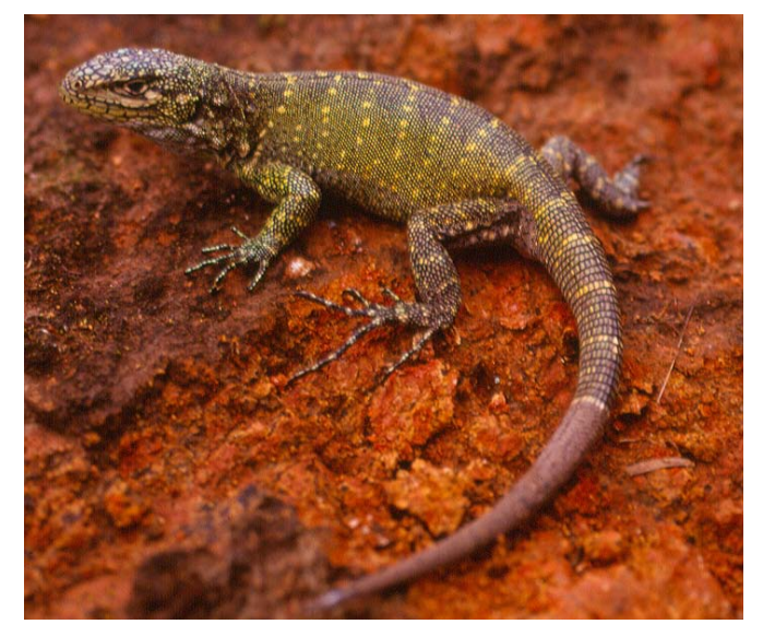
FIGURE 2. Dorsolateral view of adult female of Stenocercus humeralis (CORBIDI 00939) collected at Cerro Yantuma, Ayabaca, Peru.

Stenocercus humeralis was considered as restricted to the interandean valleys of the Catamayo (Pacific drainage) and Zamora rivers (Atlantic drainage), at elevations between 2,000-3,000 m, province of Loja, southern Ecuador (Torres-Carvajal 2000; 2007a; 2007b).