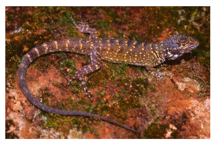
FIGURE 4. Dorsolateral view of adult male of Stenocercus humeralis (CORBIDI 00940) collected at Cerro Yantuma, Ayabaca, Peru.

ACKNOWLEDGMENTS: Fieldwork was made possible by Nature & Culture International (NCI) in Peru. Karen Siu-Ting provided the map and Jeremy Flanagan reviewed the manuscript.