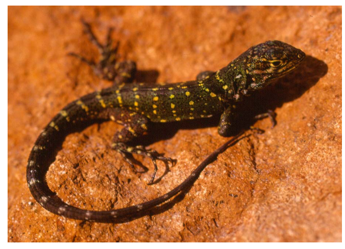
FIGURE 3. Dorsolateral view of iuvenile male of Stenocercus humeralis (CORBIDI 00936) collected at Cerro Yantuma, Ayabaca, Peru.

This new record extends the known species' distribution ca. 78.5 km SW from the southernmost record at 12.2 km south of Loja (Malacatos River Valley on road to Vilcabamba; Torres-Carvajal 2007a) (Figure 4). Stenocercus humeralis was not reported by Carrillo and Icochea (1995) or Lehr (2002) in their lists of reptiles from Peru.