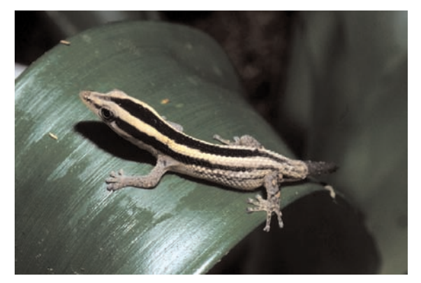
FIGURE 1. Adult Sphaerodactylus cochranae from Los Haitises National Park, Dominican Republic.

• DEFINITION. Sphaerodactylus cochranae is a moderately sized sphaerodactyl, with male SVL to 30 mm and female SVL to 28 mm. Dorsal scales are large, acute, strongly keeled, flattened, imbricate, and number 20–23 from axilla to groin. Middorsal granules or granular scales are absent. Dorsal body scales have hair-bearing organs, with 3–8 organs around the free edges of scales (occasionally 3 organs set back from the edge); each organ has 1 hair. Ventral scales are smooth, cycloid, imbricate,