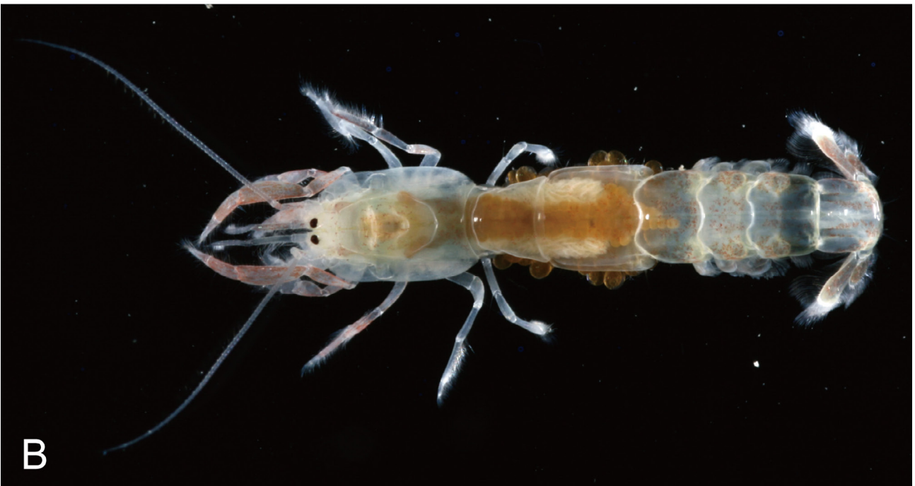
Fig. 3. Paratrypaea maldivensis (Borradaile, 1904), entire animals in dorsal view. A, male (cl 3.3 mm), RUMF-ZC-2609 (major right cheliped detached; palm damaged); B, ovigerous female (cl 3.4 mm), same lot. 図3. Paratrypaea maldivensis (Borradaile, 1904) (新称: チゴスナモグリ), 全体背面. A, 雄 (頭胸甲長 3.3 mm), RUMF-ZC-2609 (大鉗脚は外れ, 掌部が破損); B, 抱卵雌 (頭胸甲長 3.4 mm), 同ロット.

Diagnosis. Rostrum (Fig. 1A, B) spiniform, overreaching mid-length of eyestalks. Carapace (Figs. 1A, 3) with distinctly defined dorsal oval. Second abdominal somite subequal in length to sixth pleomere. Sixth pleomere (Fig. 1C) about 1.1 times longer than wide, with faint lateral notches