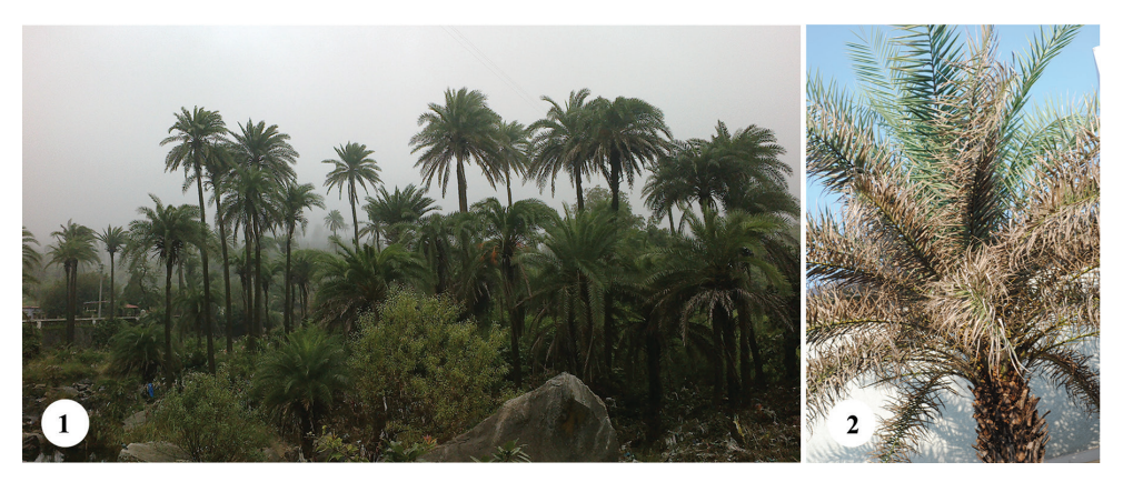
Figures 1, 2. Phoenix palms in India. I Naturally growing P. sylvestris in Mount Abu, Rajasthan 2 Javeta pallida infested P. sylvestris , Tirurangadi, Kerala.