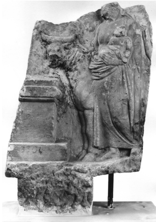
Figure 18.1 Fragmentary marble relief, from the Asclepieion, Piraeus, fourth century BCE. Athens, National Archaeological Museum 3304

The best way to treat infants until weaning is the nurse's milk that has the property to transmit the qualities of remedies to the child. Constipation, diarrhea, exanthema, aphthous ulcers can be treated through the nurse who must follow the entire treatment, including physical exercises and baths: "For as a general rule, as long as the infant is nursed, we put the wet-nurse on a regimen appropriate to the disease of the child" (Soranus, Gynaecology 24[57]). Even epilepsy could be treated through the nurse's milk (for example, Caelius Aurelianus, On Chronic Diseases 1.4). Was the procedure debated? Some could ask if the remedies would unhappily affect the nurse's health. Soranus (2.24[56]) explains that, appropriately dosed, the product only reaches the baby, since it is more sensitive.