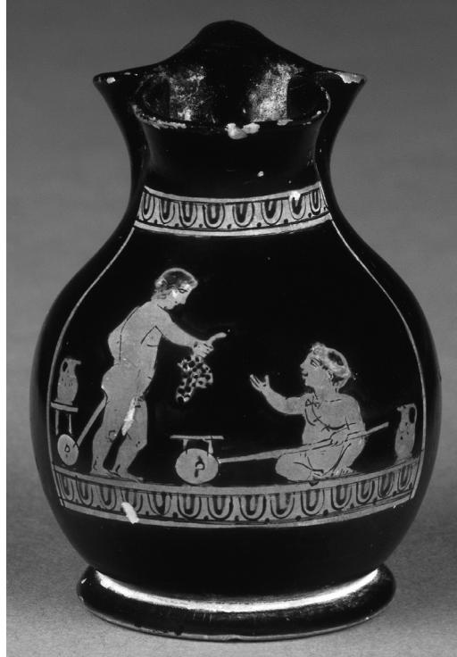
Figure 18.10 Attic red-figure chous, 420–410 BCE. London, The British Museum E 536; © and courtesy of the Trustees of the British Museum.

non-kin members who shared responsibility, guilt, and anxieties, and helped “cushion” the loss of the child. The divinization of nursing ( kourotrophic ) practices witnesses the importance of the task (Figure 18.9) (Dasen (1997)). Did not Demeter herself transform into the nurse of the baby Demophon when she arrived in Eleusis? ( Homeric Hymn to Demeter 219–74; Pirenne-Delforge (2010); but cf. Bonfante (1997) on the disquieting connotation of nursing mothers exposing their breasts in classical art).