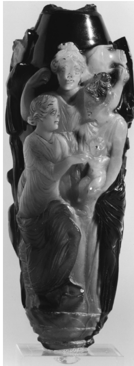
Figure 18.6 Onyx alabastron, ca. 50–30 BCE. Berlin, Antikensammlung, Staatliche Museen FG 11362