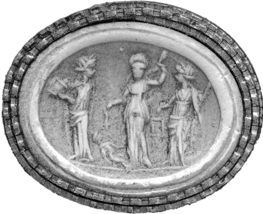
Figure 18.3 Glass paste (cast), Roman period. London, The British Museum 3079; © and courtesy of the Trustees of the British Museum.

as it was born alive and had cried. The patria potestas was created by the birth itself, whether the father was present or not at the time of delivery, as long as the child was born from a iustum matrimonium between two free citizens. The rights of the child as potential heir even existed before birth; the inheritance rights of the fetus were duly protected (for example, D 28.2.4, Ulpian).