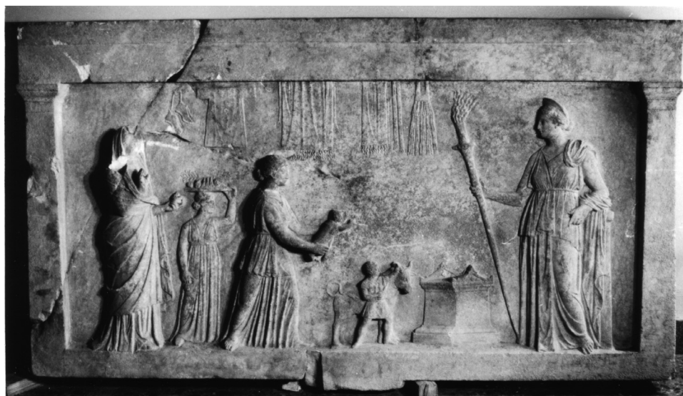
Figure 18.5 Marble votive relief, from Echinus, ca. 300 BCE. Lamia Museum AE 1041; courtesy of Lamia Museum.

In Rome as in ancient Greece, the reason for postponing the naming is partly associated with the high infant mortality (cf. Aristotle, History of Animals 588a8–10). The slow transformation of the child's body through bath, massage, and food played a role too.