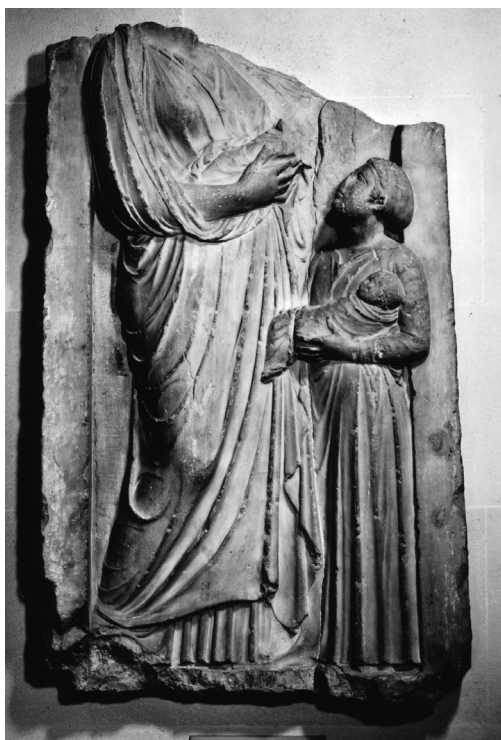
Figure 18.2 Attic marble grave stele, second quarter of the fourth century BCE. Paris, Louvre MA 3113; © and courtesy of Musée du Louvre/Maurice and Pierre Chuzeville.

births form a special category of offspring, arousing ambivalent reactions, welcomed as a sign of divine favor when they are two (cf. Figure 18.9) or eventually three, portentous, as a disruption of the natural order when three or more are born simultaneously, partly because of the fatal issue of such deliveries (Figure 18.2) (Dasen (2005a), (2005b)).