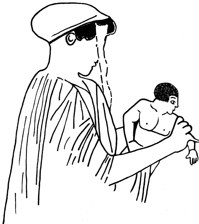
Figure 18.11b Lekythos , manner of the Pistoxenos Painter, ca. 470 BCE. Oxford, Ashmolean Museum V 320; drawing by Véronique Dasen.