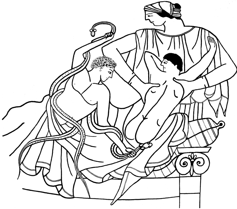
Figure 18.11a Stamnos, Berlin Painter, ca. 480 BCE. Paris, Louvre G 192; drawing by Véronique Dasen.