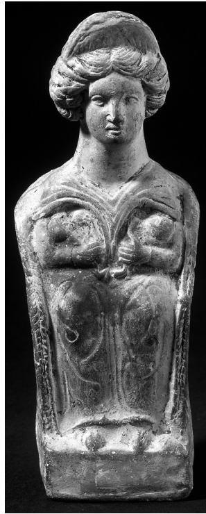
Figure 18.9 Terracotta, second century CE. Musée gallo-romain de Lyon, Département du Rhône, inv. Comarmond 117; © and courtesy of Ch. Thioc.

The nurse's social function was extensive. Her role did not stop at the weaning period. Much evidence shows that in Greece as in Rome she was a life-long companion. In positive circumstances, she could construct non-kin relationships and became, through connections not of blood, but milk, a member of an extended family. Funerary inscriptions and literary sources show that some nurses were rewarded by freedom (cf. Gaius, Institutes 1.38–39; lists of nutrices in Bradley (1991) 13–36). Breast-feeding also created milk-ties between the nurslings ( syntrophoi , trophimoi , collactanei ; cf. Plutarch, Cato 1.20.5–7, on Cato the Elder inciting his wife to feed the home-born slaves) who could gain social elevation thanks to this bonding (for example, Corbier (1999a) 1280–1284).