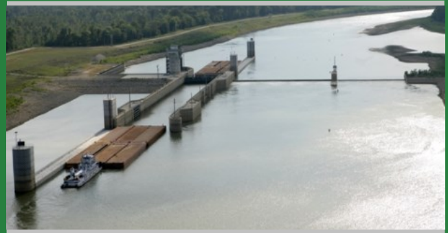
Photo: Montgomery Point Lock and Dam of Little Rock District is noted in 2019 NRM Assessment to have occasional occurrences of the rabbitsfoot mussel

In the 2019 NRM Assessment, the Appalachian monkeyface, stirrupshell, and Texas pimpleback are listed as having the potential to occur at a single project within their respective ranges.