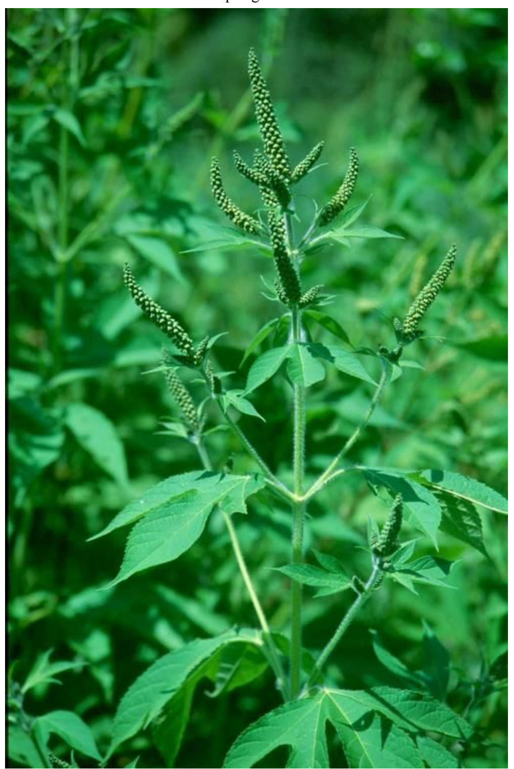
Figure 1 Photo by Louis-M. Landry from CalPhotos. Web. 27 May 2020.

ESRM 412 - Native Plant Production Spring 2020