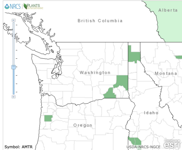
North American Distribution