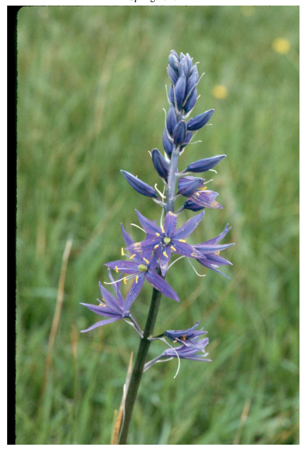
Figure 1

ESRM 412 - Native Plant Production Spring 2020