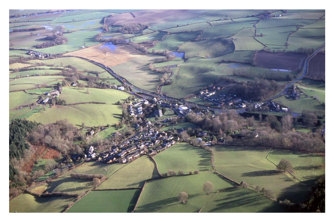
Clyro village, photo 00-C-0079

We have not referenced the sources that have been examined to produce this report, but that information will be available in the Historic Environment Record (HER) maintained by the Clwyd-Powys Archaeological Trust. Numbers in brackets are primary record numbers used in the HER to provide information that is specific to individual sites and features. These can be accessed on-line through the Archwilio website (www.archwilio.org.uk).