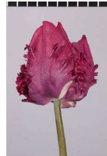
Group 1: Convex