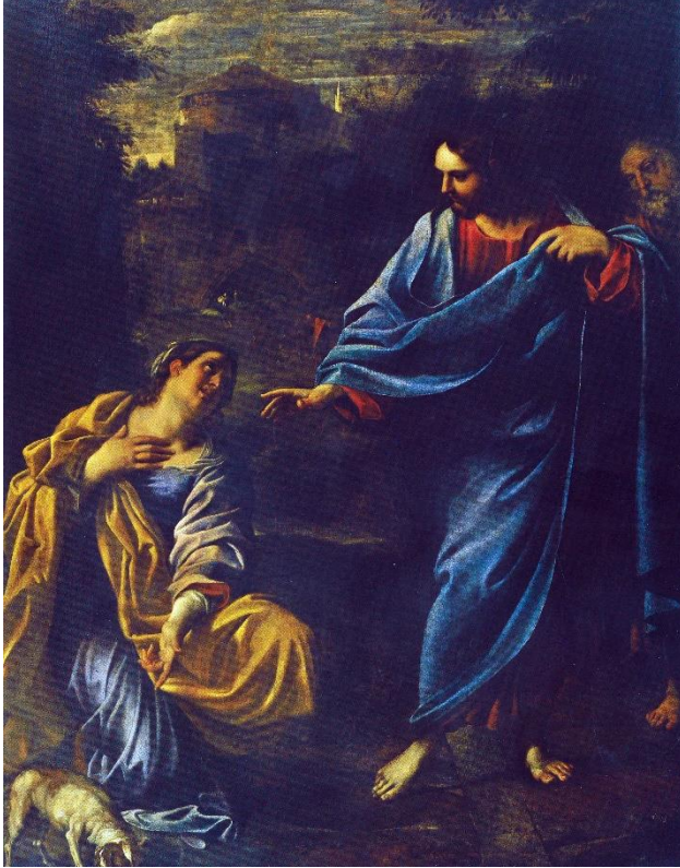
Cristo e la Cananea (Christ and the Canaanite Woman) 1594–1595, Annibale Carracci (1560–1609) Pinacoteca Stuard, Parma

Holy Eucharist August 20, 2023, 10:00 a.m.