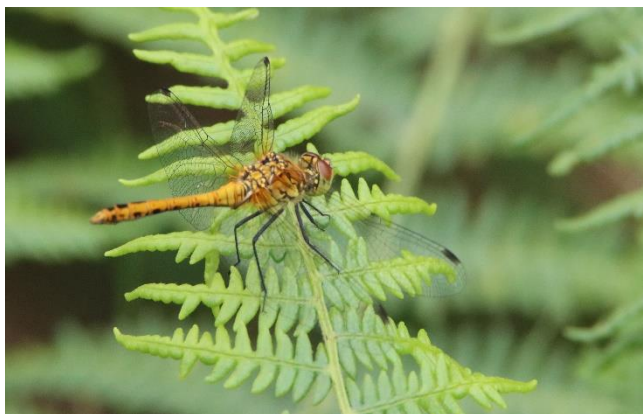
Black Darter (immature male)