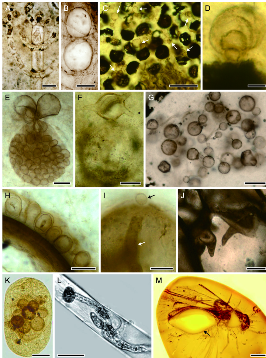
Figure 1: Examples of fossil fungal parasites: Chytridiomycota and zygomycetous fungi. A. Portion of charophyte Palaeonitella cranii showing normal cell size from Lower Devonian Rhynie chert; colour version of fig. 1 in Taylor et al. (1992a); bar 100 \mu\text{m} . B. Hypertrophied cells of P. cranii from Lower Devonian Rhynie chert; colour version of fig. 26 in Taylor et al. (1992c); bar 200 \mu\text{m} . C. Partially degraded sporegonia of Rhizophyditis matryoshkai (arrows) from Lower Devonian Rhynie chert; fig. 1E in Krings et al. (2021); bar 100 \mu\text{m} . D. Rhizophyditis matryoshkai with four generations of zoosporangia occurring one inside another from Lower Devonian Rhynie chert; fig. 5A in Krings et al. (2021); bar 10 \mu\text{m} . E. Fungal intruders of enigmatic propagule clusters in microbial mats from Lower Devonian Rhynie chert; fig. 2a in Krings and Harper (2019); bar 10 \mu\text{m} . F. Illmanomyces corniger zoosporangium on host spore from Lower Devonian Rhynie chert; fig. 2a in Krings and Taylor (2014); bar 50 \mu\text{m} . G. Globicultrix nugax in glomeromycotan spore from Lower Devonian Rhynie chert; fig. 2.2 in Krings et al. (2009b); bar 20 \mu\text{m} . H. Thallus of Brijax amictus in ephemeral outer wall component of glomeromycotan acaulospore from Lower Devonian Rhynie chert; pl. III, fig. 8 in Krings and Harper (2020); bar 25 \mu\text{m} . I. Callosity (white arrows) in glomeromycotan spore; note sporangium of parasite on host spore surface (black arrow) from Lower Devonian Rhynie chert; fig. 31 in Krings (2022); bar 10 \mu\text{m} . J. Callosities in lycopod periderm from Visean (Mississippian) chert deposits in France; pl. II, fig. 12 in Krings et al. (2009a); bar 20 \mu\text{m} . K. Chytrid-like inclusions in gymnosperm pollen grain from Upper Permian of India; fig. 2C in Aggarwal et al. (2015); bar 20 \mu\text{m} . L. Developing spore of a fungal pathogen inside a nematode from Miocene Mexican amber; fig. 2A in Jansson and Poinar (1986); bar 10 \mu\text{m} . M. Termite bearing white colonies of an entomophthoralean fungus (arrow) from Miocene Dominican amber; colour version of fig. 1 in Poinar and Thomas (1982); bar 1.0 mm. A, B. Courtesy of Hagen Hass and Hans Kerp, University of Münster. L, M. Courtesy of George O. Poinar, Oregon State University.