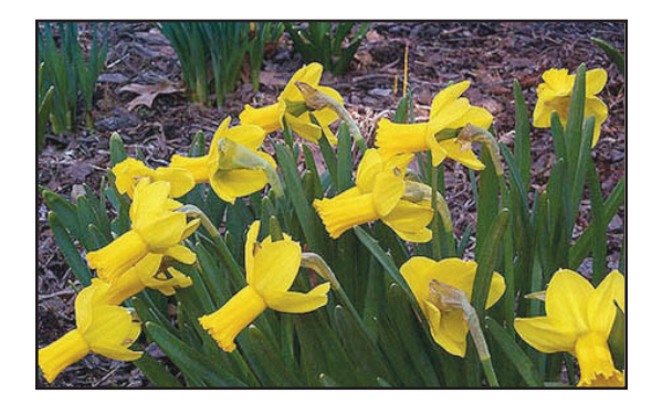
'Swift Arrow' 6 Y-Y (Mitsch) in Tom Stettner's Cincinnati, OH, garden

Daffodil growers' photographs of flowers in their own gardens.