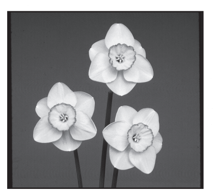
'Pacific Rim' 2Y-YYR