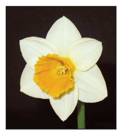
Scottsburg, IN – Libby Frey 'Orange Supreme' 2 W-O