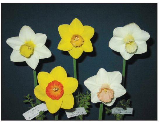
National Convention Show; Australian Award Kathy Welsh Top row, from left: 'Punter' 2 W-Y, 'Machan' 2 Y-Y, 'Quark' 1 W-W' Front row, from left: 'Shock Wave' 2 Y-O, 'Cryptic' 1 W-P