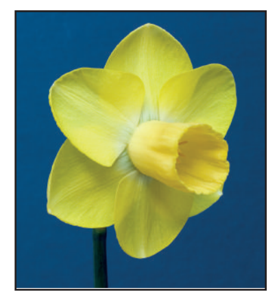
Albany, OR – Elise Havens 'American Classic' 2 Y-WYY