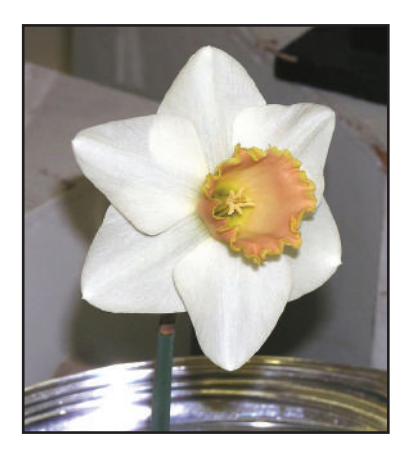
Livermore, CA – Dian Keesee 'Sundust' 2 Y-Y