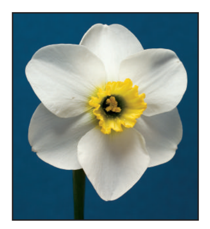
Murphys, CA – Kirby Fong 'Bridget Cramsie' 2 W-GWY