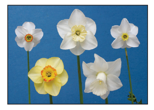
Albany, OR RED WHITE & BLUE Ribbon Barbara Rupers Top row, from left" 'Proxy' 9 W-GYR (Evans), 'Painted Desert' 3 Y-GYO (Throckmorton), 'White Tie' 3 W-W (Throckmorton) Front row, from left: Rupers #85-9-11, 'Denali' 1 W-W (Havens)