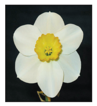
Cincinnati, OH – Tom Stettner 2 W-Y #K87-76-3 'Easter Moon' x 'Eileen Squires'