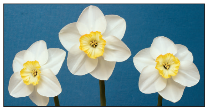
Albany, OR – Peggy Tigner 'Nordic Rim' 3 W-WWY [Kirby Fong photograph]