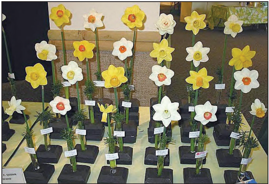
Mary Lou Gripshover's winning Quinn Collection – Cincinnati, OH Back row: 'Sabre' 2 Y-R, 'Poema Trompetei' 2 W-P, Vinisky V89/36/33 2 Y-O, 'Fortesque' 4 W-R, 'Wild Honey' 2 YYW-Y, Three Oaks' 1 W-Y

Bottom row, from left: 'Feline Queen' 1 Y-O, #2232, 'Surrey' 2 Y-R, 'Queen's Guard' 1 W-Y