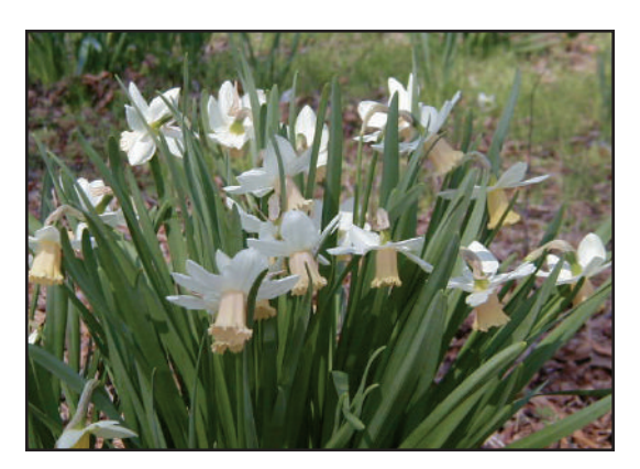
'Waif' 6 W-P (Cairncairn) in Sandra Stewart's garden in Jasper, Alabama