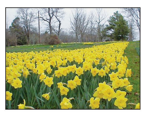
'Orange Frilled' 2 Y-O (P.van Heusen, 1943) in Keith Kridler's fields in Mt. Pleasant, Texas