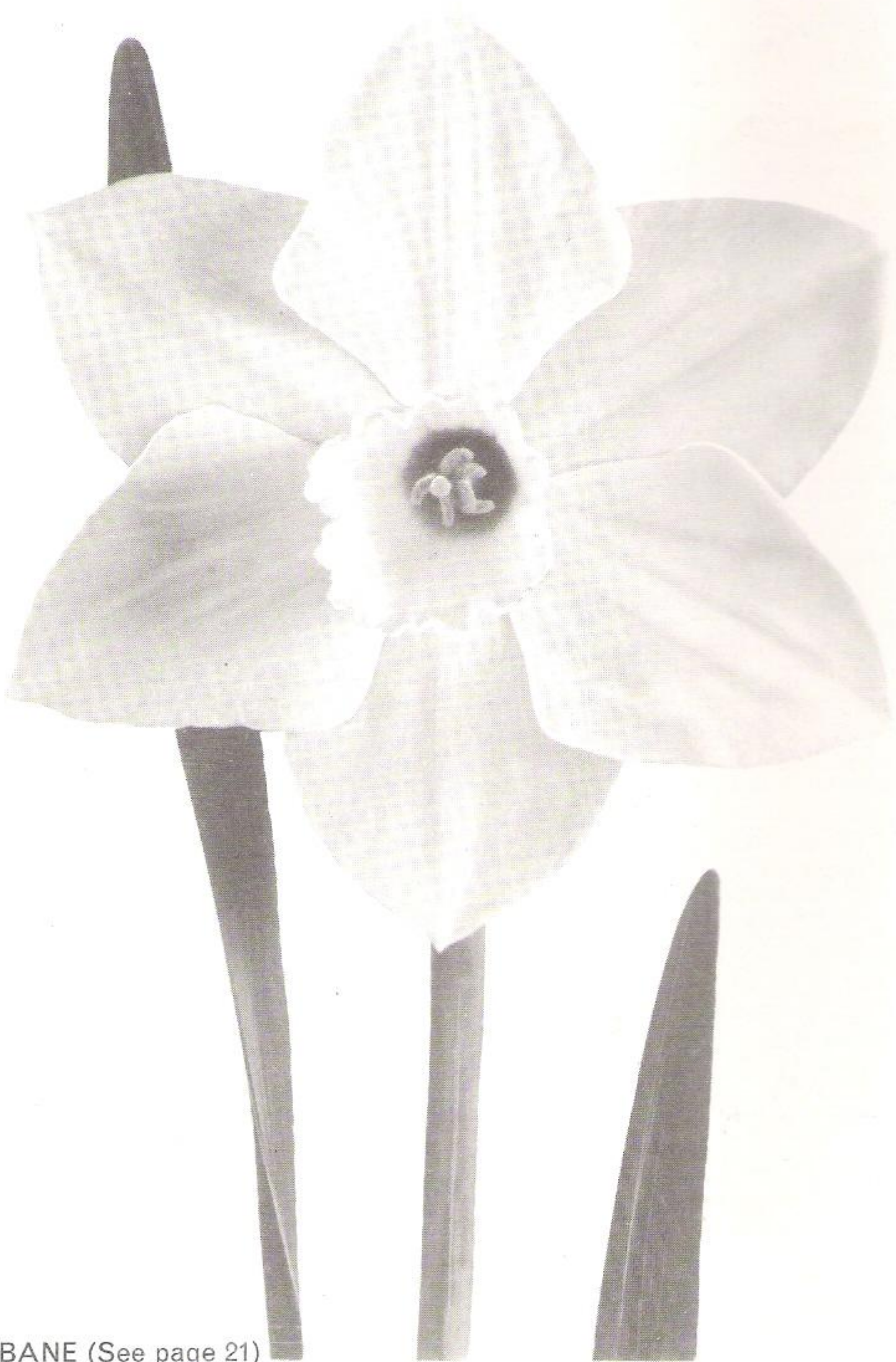
KNOCKBANE (See page 21)