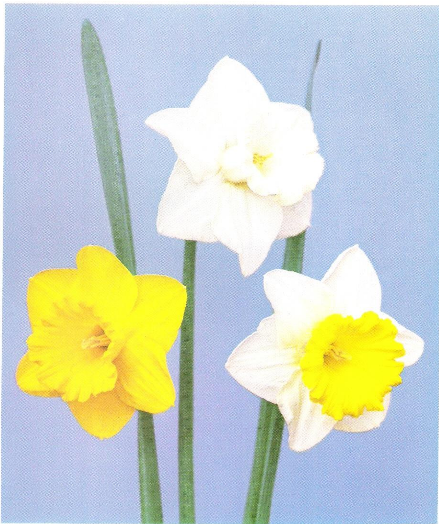
BAWNBOY (See page 2)