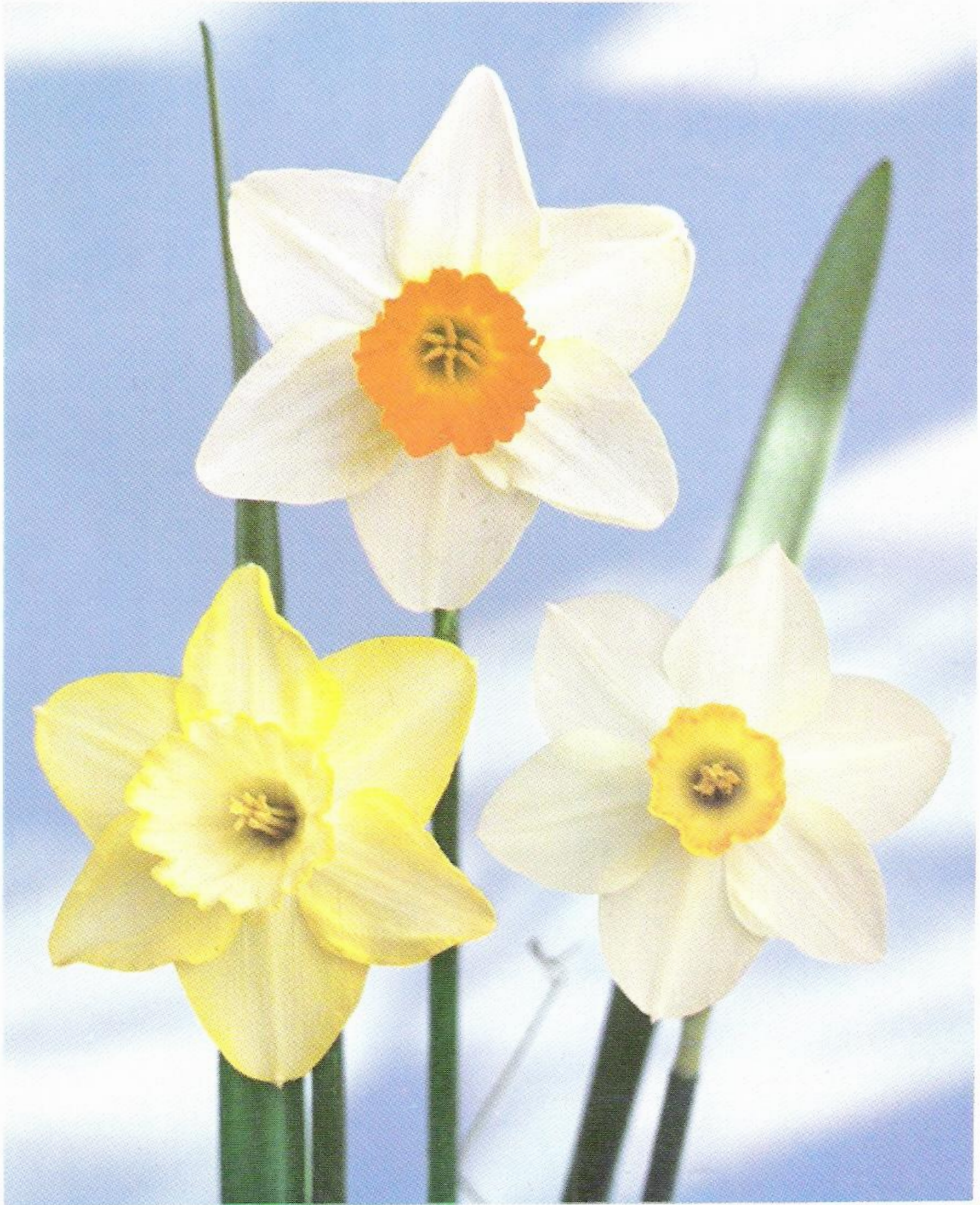
BINKIE (See page 8)