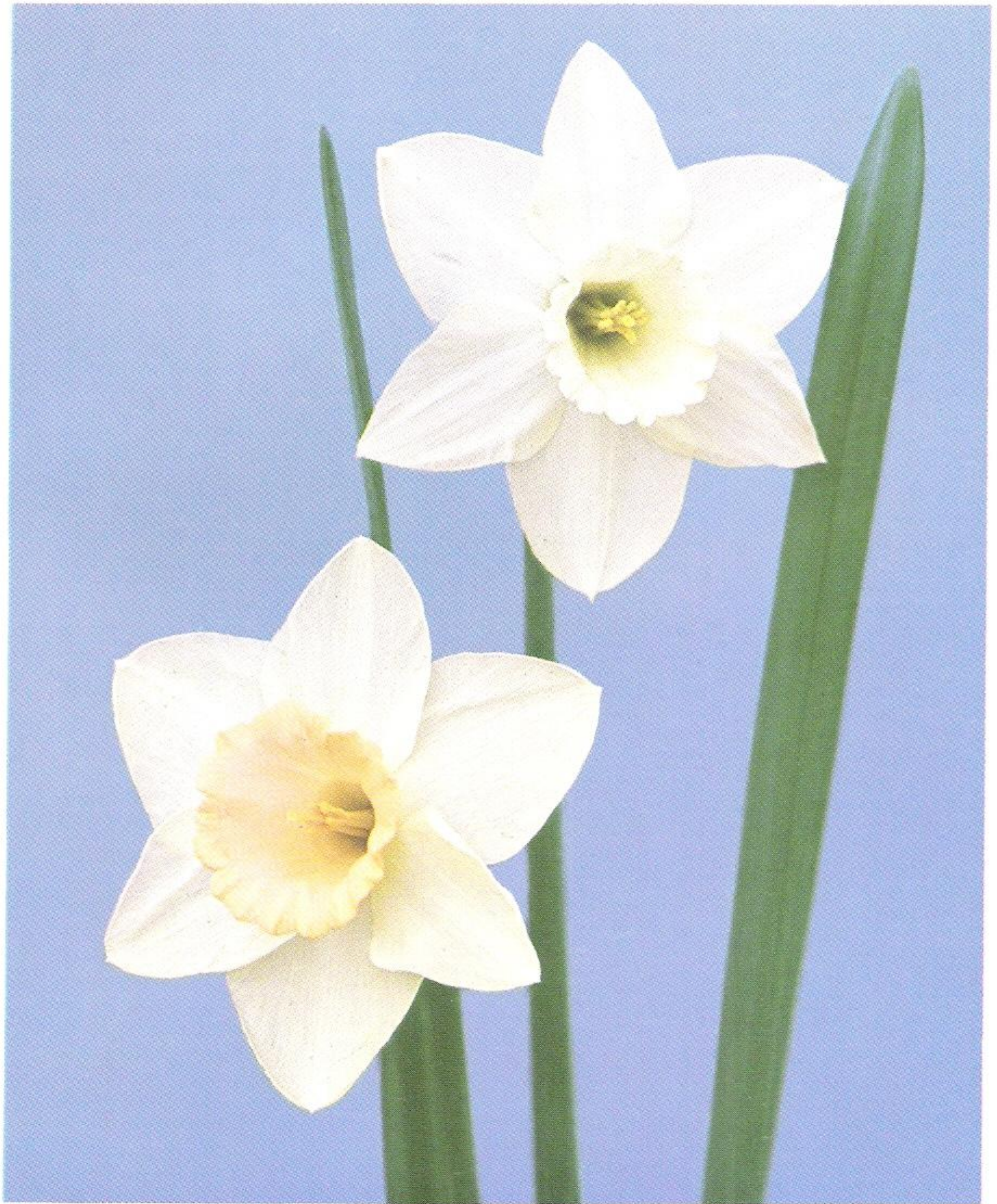
PASSIONALE (See page 14)