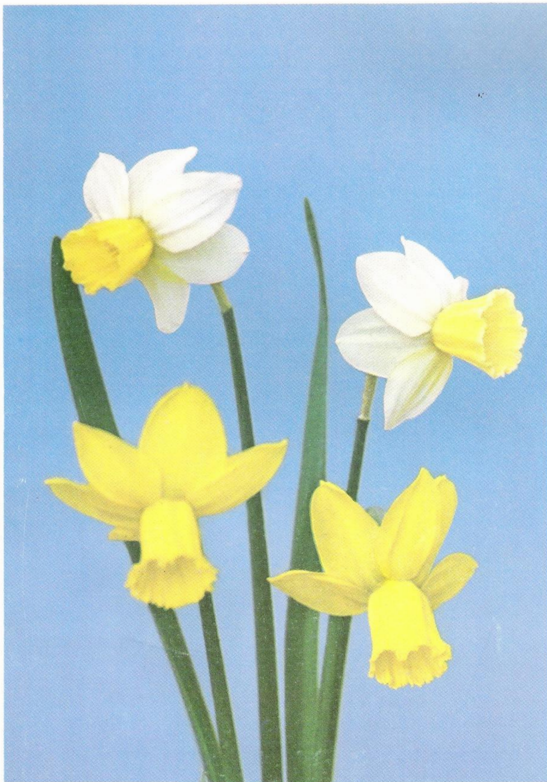
DOVE WINGS (See page 30) CHARITY MAY (See page 29)