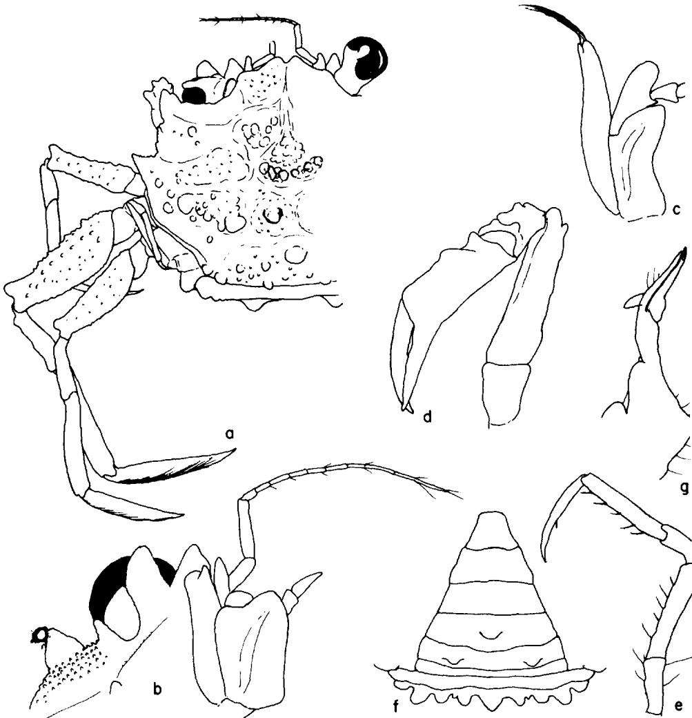
Fig. 3. Palicus elaniticus n.sp., holotype ♂. a. Animal in dorsal view. b. Orbital region in ventral view (third maxilliped strongly foreshortened). c. Third maxilliped. d. Cheliped. e. Fifth pereopod. f. Telson. g. Gonopod. a & f, x 13.75; b-e, g x 27.5.

The present specimens were taken in depths varying from 37 to 45 m and 73 to 82 m. Zarenkov's (1971:173) specimens came from depths between 25 and 60 m.