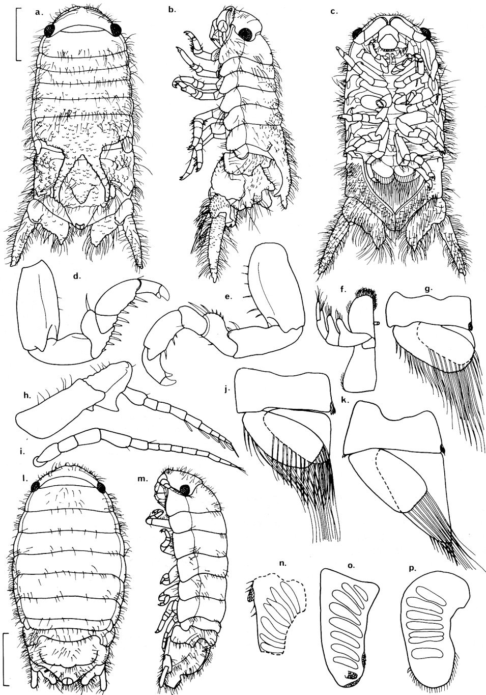
FIG. 3: Dynamene ramuscula Baker. Adult male (a) dorsal, (b) lateral, (c) ventral, (d) pereopod 1, (e) pereopod 3, (f) maxillipede, (h) antennule, (i) antenna, (g, j, k) pleopods 1-3 respectively, (n) proximal external margin of damaged exopod of pleopod 4, (o) exopod of pleopod 5, (p) endopod of pleopod 5. Ovigerous female (l) dorsal, (m) lateral. Scales represent 1 mm.