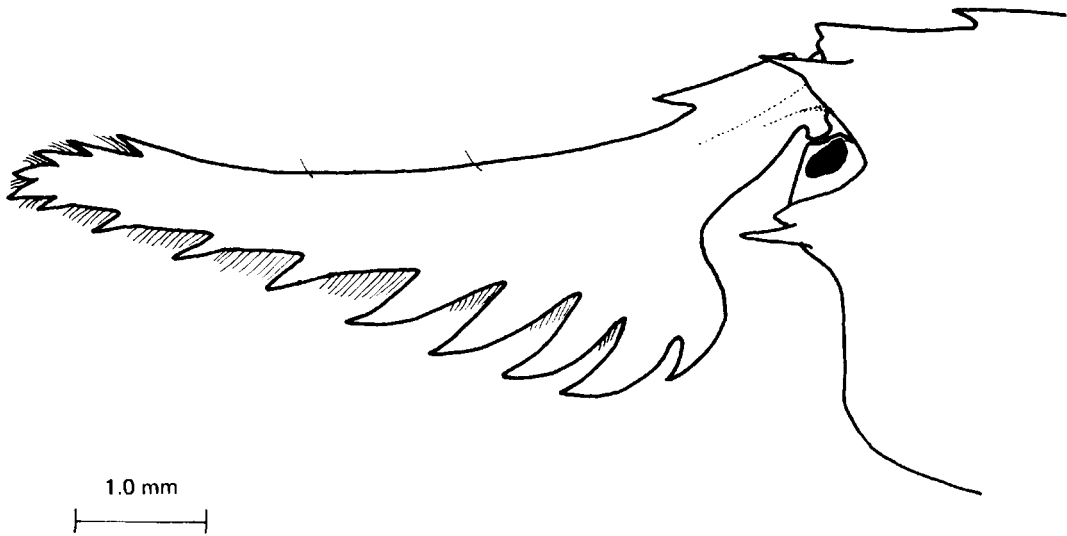
Fig. 1. Rhynchocinetes balssi Gordon: ♂, CL 4.3mm, rostrum.