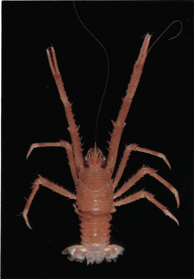
Textfig. 1. Munida albiapicula , male holotype, dorsal view.

Cornea inflated and depressed, eyelashes short.