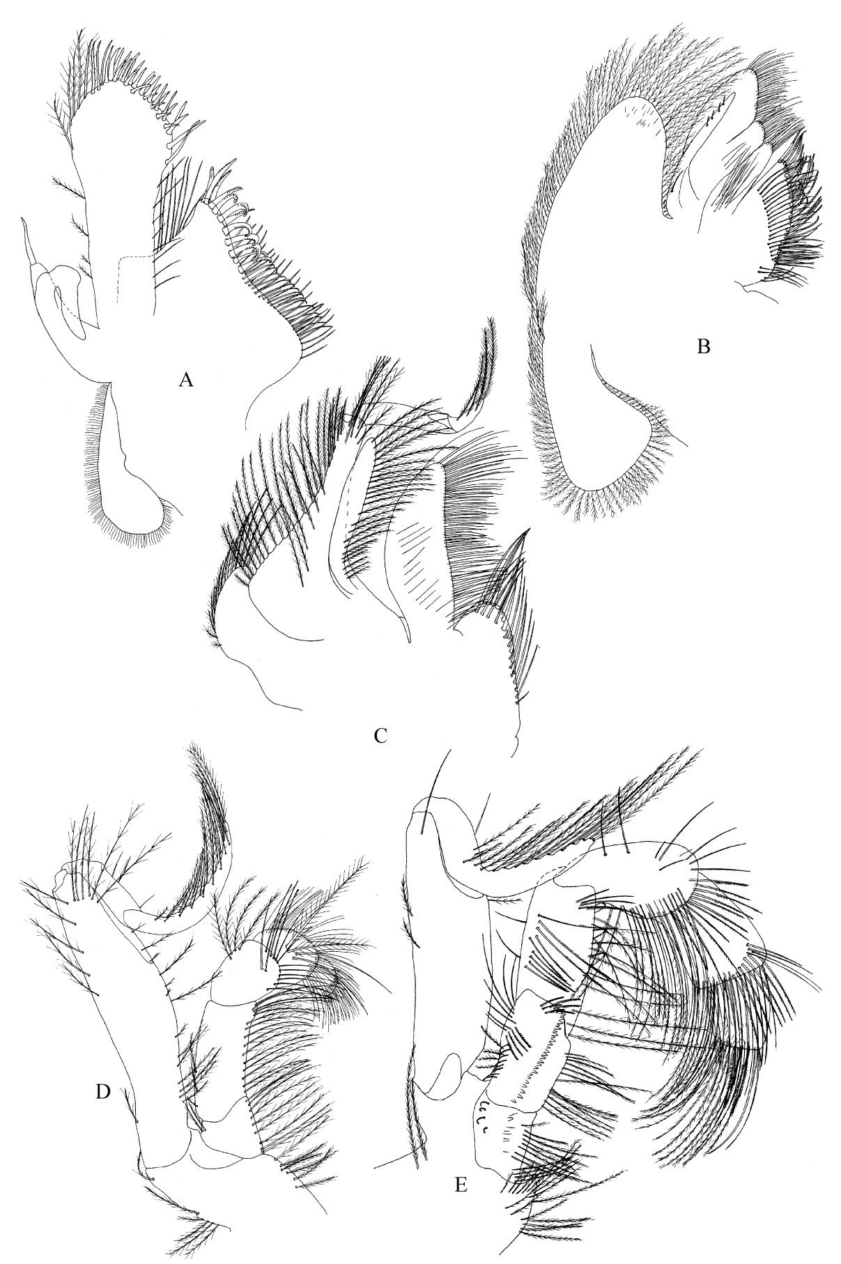
FIGURE 2. Tetralobistes bicentenarius gen. nov. and sp. nov. , A–E, holotype female (SL, 2.10 mm) (EMU-8730). Left mouthparts, inner view. A, maxillule; B, maxilla; C, first maxilliped; D, second maxilliped; E, third maxilliped.