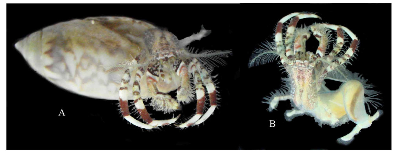
FIGURE 4. Tetralobistes bicentenarius gen. nov. and sp. nov. , A–B, paratype male (SL, 1.68 mm) (EMU-8866). A, live specimen in shell; B, same, removed from shell, dorsal view.