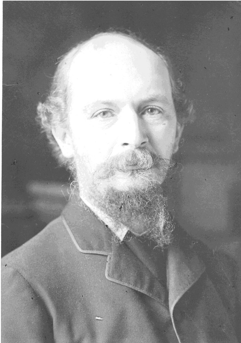
Photo of Swinburne in advanced age, undated.