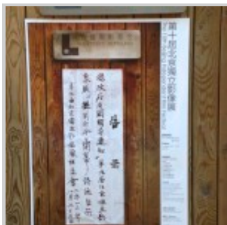
The 2013 film festival poster