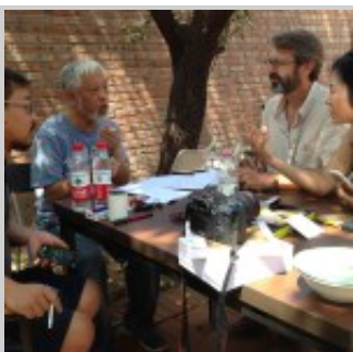
One of many lively courtyard