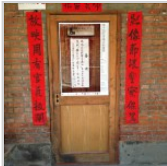
Door to one of two theaters at the Li Hsiangting Film Institute.