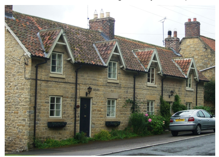
Swiss Cottages, Main Street: gabled half dormers typical of Oswaldkirk's paired Victorian cottages

Vernacular roof forms are generally of simple dual pitch construction, with only the grandest