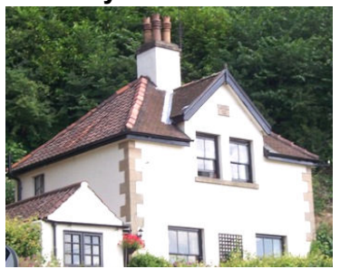
Crag Cottage, Main Street: central chimney stack

Chimney stacks make an important contribution to the