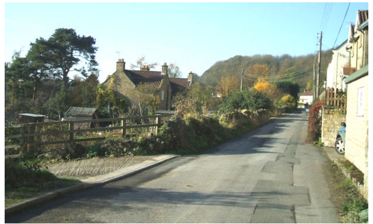
The Terrace: elevated terraces to the north face wide gaps between twentieth century buildings to the south. In places, boundaries have been eroded.

10.6 Oswaldkirk Bank was mostly developed in the early twentieth century, with the building of Crag Cottage, Cliff House (1919) and The Bungalow (1920s), buildings that exemplify a change in the way of life from that of an exclusively agricultural community that inhabited farms and cottages to a community that attracted richer 'incomers' who introduced fashionable, non-vernacular building styles and constructed houses that were elevated to take advantage of views and light.