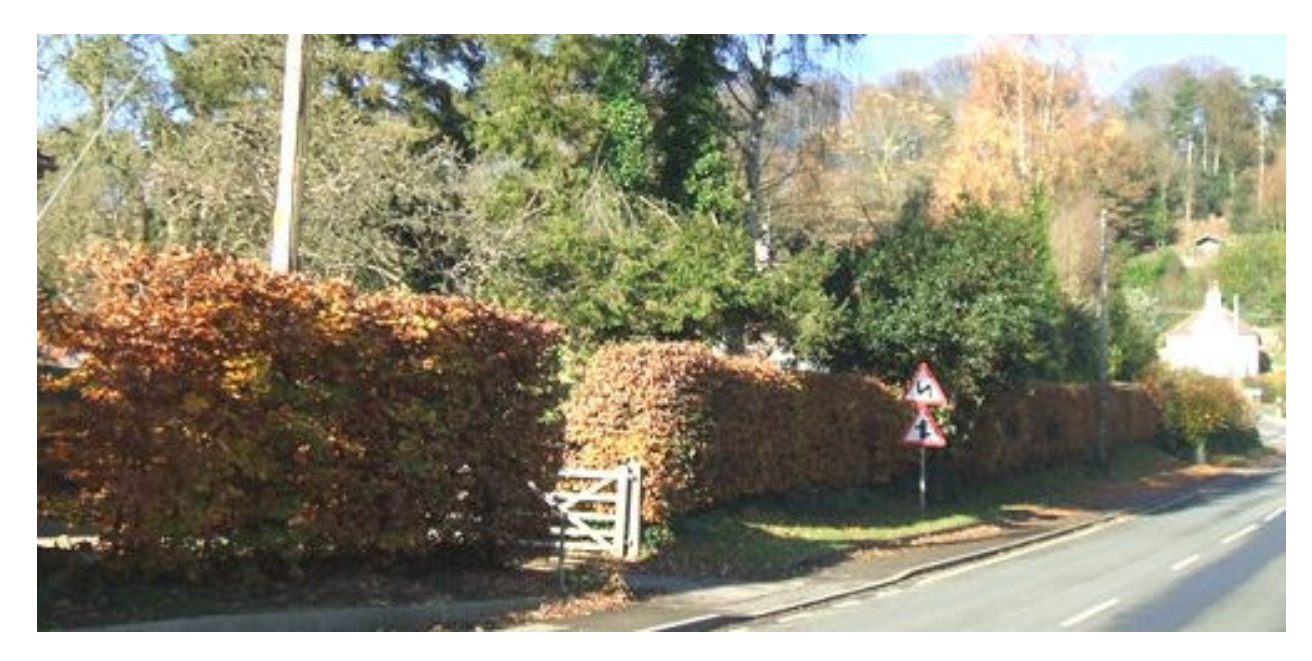
Verdant hedging boundaries characterise the Conservation Area

Boundary treatments should be carefully selected to maintain the rural appearance of the village. Native species hedging (such as beech) and stone walls (using local stone bedded dry or in lime mortar) are the most visually important boundary forms in the village, but additional suitable treatments include low timber picket gates and fences; cast iron fencing to match that seen on The Terrace; or simple painted steel 'estate' type fencing. Designs should generally be plain and low to ensure that the fencing does not overpower the host property, impair visual permeability or detract from the rural setting of the village. Further hedge planting could help to strengthen boundaries within the street scene. The further erosion of characteristic boundary treatments will be resisted.