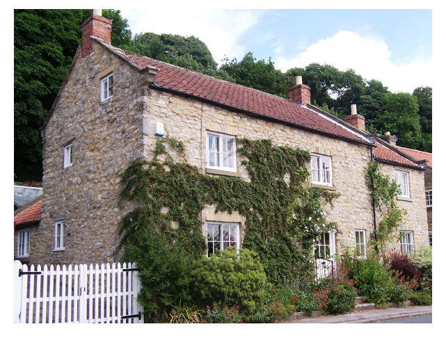
Ivy Cottage, Main Street

Oswaldkirk Hall/Hall Farm. The ancillary buildings are characterised by generally being sited at right angles to Main Street, in contrast to houses which generally present their principal elevation to the road. Smaller historic structures visible from public vantage points also add character to the Area, such as those at Bank Cottage, The White House and Abbey House, as well as the K6 model public telephone box, designed by Sir Giles Gilbert Scott in 1935 to commemorate the Silver Jubilee of King George