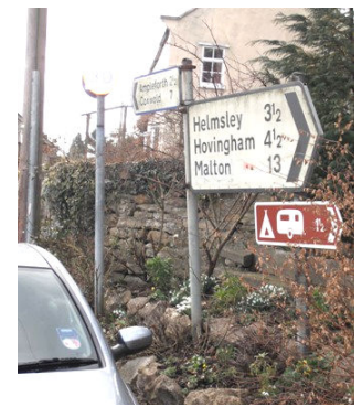
Incremental addition of

There are few other advertisement signs as the village has few services. Where there are signs, for example at The Malt Shovel, they are of simple painted timber design using subtle colour schemes that signage creates visual clutter blend in with the traditional street scene.