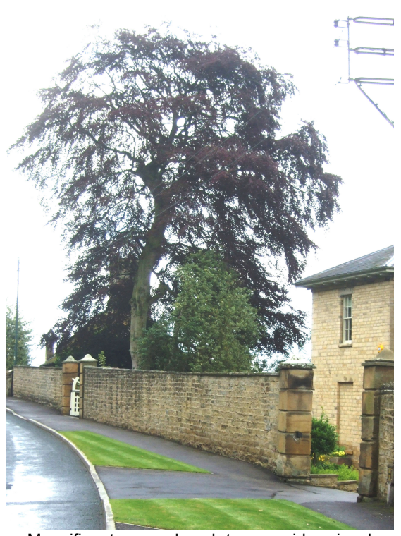
Magnificent copper beech tree provides visual punctuation in the street scene

Trees make a highly important contribution to the character of the Conservation Area and its setting. The Hag is defined as Section 3 Woodland and Ancient Woodland. Section 3 Woodland is defined in accordance with Section 3 of the Amendment to the Wildlife and Countryside Act of 1985 which required National Park Authorities to prepare a map showing areas of woodland (and other landscapes) whose natural beauty is particularly important to conserve. Ancient woodland is defined as one that has been in existence for at least 400 years.