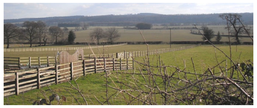
Post and rail fencing can be alien to the rural character of surrounding fields and should generally be avoided except where supporting the establishment of new hedgerows

Some fields to the east and south of Conservation the Area have been divided up using timber post and rail fences. Such fences represent a nontraditional form of field boundary in this area, and are visually prominent.