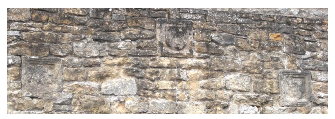
manor was fairly extensive by the mid-sixteenth century. Written deeds available from 1566 The three shields of the Pickering family from the former manor house

There are still three shields of the Pickering family visible on the retaining wall beside the road opposite the church. In 1674 the manor was sold to William Moore who was responsible for demolishing the old manor house and building (as successive manor houses) the present Malt Shovel Inn and the Hall. Only St Oswald's Church survives from before the seventeenth century.