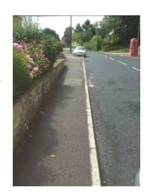
Concrete kerbing and tarmac footpaths erode rural character

A footpath runs the length of Main Street to the southern side and continues along the western side of the Gilling road providing pedestrian access to the play area. The use of standard materials, black tarmac and concrete kerbs without a softening verge strip creates an engineered, urban appearance which contrasts with the natural edging to the north of Main Street. The extension or widening of tarmac surfaces, particularly at the expense of areas of grass verge, would be detrimental to the appearance of the Area. Additional concrete kerbing should be avoided in favour of a verge or, if essential, more rustic natural stone kerbs.