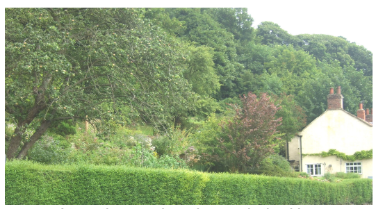
Attractive gardens beneath the Hag

As there is little formal public open space, the majority of green spaces that contribute to the character of the Conservation Area are private gardens, fields or woodland. Green spaces may be valued for a range of reasons including preserving the setting of Listed Buildings and of buildings that make a positive contribution to the Area; maintaining attractive verdant spaces that provide relief and punctuation within the streetscape; allowing views out of the Area to the wider landscape; or hosting visually and ecologically important trees.