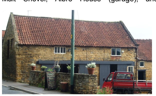
Malt Shovel barns

10.4 Main Street forms the historic core of the village with historic buildings dating largely from the first half of the nineteenth century and earlier. It contains the most architecturally distinguished buildings in the village - St Oswald's Church: Oswaldkirk Hall outbuildings: the Malt Shovel Inn: and The Old Rectory – as well as humbler, more vernacular eighteenth-century buildings including Abbey House, Ivy Cottage and Manor Farm. A number of former farm buildings, some converted to other uses, survive along the length and to the south of Main Street that are important reminders of the village's agricultural past, notably buildings adjacent to Manor Farm, the Malt Shovel, Albro House (garage), and