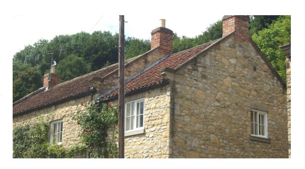
Stone water-tabling, kneelers and cast iron rainwater goods

Traditional and vernacular buildings characterised by stone coping at the gable often with kneelers terminating at the eaves. Half-round guttering is supported by metal brackets or spikes fixed directly to the stonework without fascia boards. Victorian cottage developments and later buildings omit stone copings in favour of simple barge boarding. The rafter ends may be left exposed under overhanging eaves. rainwater goods are always of robust cast iron. The original style of detailing should always be respected.