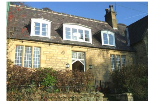
Former village school, now Southlands

back from and at a lower level to the road, with established