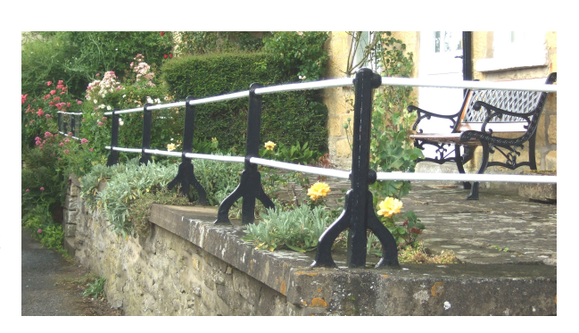
Cast iron railings along The Terrace

The use of boundary treatments such as native hedging and cast iron rails, such as those seen at the start of The Terrace, in addition to the traditional stone wall can provide interest and privacy, and where they exist they should be preserved. In particular, the planting of native hedges is desirable in order to strengthen boundaries and help to integrate more recent development. Some retaining walls have been constructed during the twentieth century using inappropriate stone and to an overwhelming height. These have a severe appearance that is not keeping with the Oswaldkirk aesthetic.