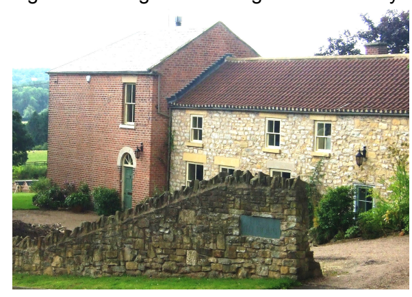
The Red House: Welsh slate and pantile

Welsh slate became cheaper than pantiles and as a result some buildings were built and reroofed in the later-nineteenth century using slate. Twentieth-century buildings have mostly utilised clay tiles for roofing, in styles characteristic of their age: plain clay tiles on the Edwardian Cliff House and Crag Cottage; roman pantiles on the 1920s Old Post Office and the 1930s bungalows. These clay tiles have weathered attractively to harmonise with the older weathered pantiles, and the distinctions in style of tile should be maintained where of quality to reflect the age and style of building and roof form. Modern roof coverings such as tiles of composite materials, tiles with artificial colouring or imported slates that