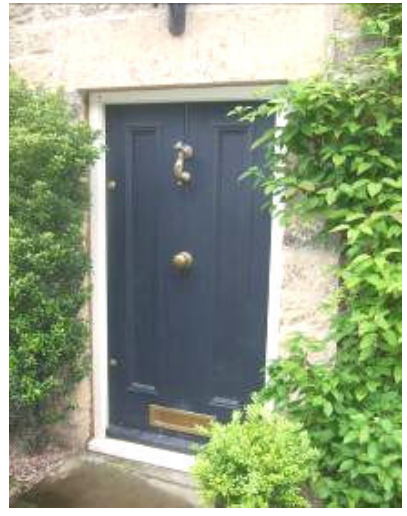
Quality traditional joinery

Where historic joinery survives, every effort should be made to