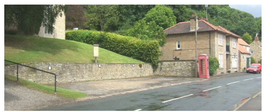
Loss of traditional boundaries and areas of hard standing can be detrimental to the street scene

Oswaldkirk has avoided the road markings and highways structures associated with traffic restrictions, however parking and traffic is a concern to some village residents. Any future proposals for traffic restrictions should be sensitively designed to avoid markings, signage, barriers or lighting that would be detrimental to the rural character of the Area, and the local planning authorities would wish to be involved in discussions between parties at an early stage to seek to mitigate any negative impacts of such installations. The creation of additional off-street parking should preserve traditional boundary treatments, and appropriate screening should be provided to preserve the attractive street scene.