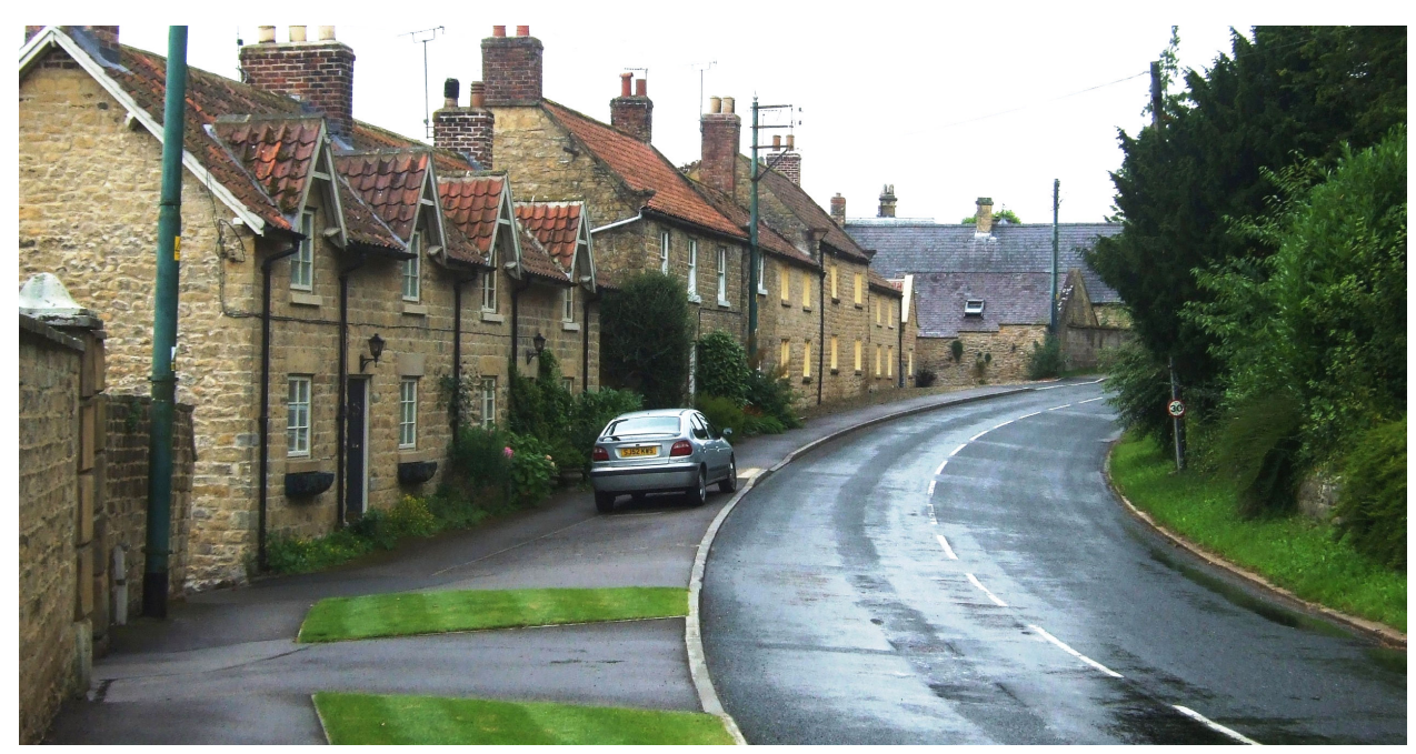
Western end of Main Street

9.1 Main Street has a strong built form towards its eastern and western ends, with the central part of the street in-filled by later development which has little relation to the historical built character of the village. To the eastern and western ends, the often densely built frontages of attached buildings, the close positioning of buildings to the highway and the elevated plots and high retaining walls to the north side, a consequence of the rising hillside, together create a dense streetscape form. Development to the northern side is more sporadic than on the south side due probably to the rising ground and buildings are generally detached and occupy more substantial plots, providing large open gaps in the streetscene which are well planted and allow a close visual connection with the wooded hillside.