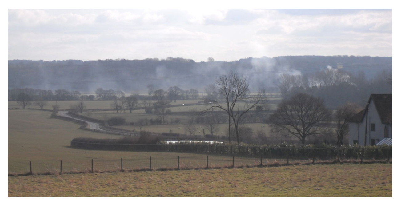
Trees contribute to parkland-style setting

The National Park Authority's Design Guide Part 3: Trees and Landscape SPD contains detailed guidance and advice on the retention and protection of good quality trees and trees of amenity value, planting additional trees where appropriate and providing well-designed, sustainable landscape schemes. It provides lists of suitable native shrub, tree and woodland planting by character area, and guidance on hedgerow planting.