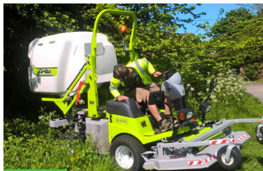
(From Dorset CC)