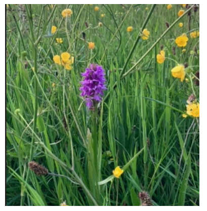
Meadow management - Llandybie

Visibility splays and swathes alongside paths and roads will continue to be cut more regularly.