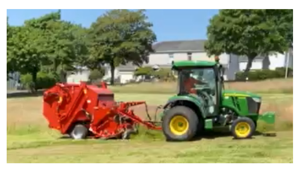
Management taking place at Heol Gwili fields