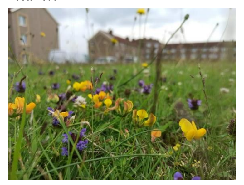
Nectar Cut areas where slightly higher grass height is desired, allowing short flowering plants to flower and set seed.