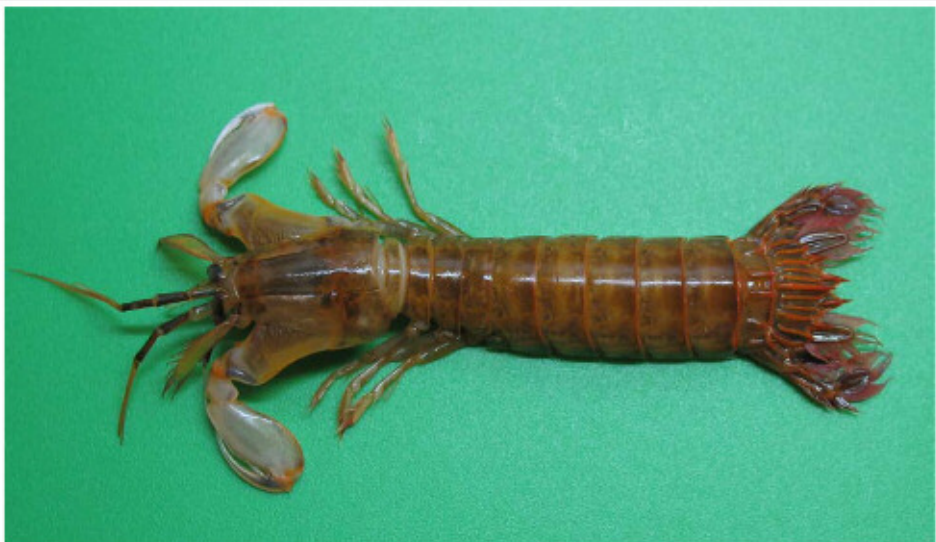
Fig. 2. Pseudosquillaopsis cerisii (BRC code: ICMS000025), male, 18.0 mm CL, dorsal view. Fig. 2. Pseudosquillaopsis cerisii (código BRC: ICMS000025); macho; 18,0 mm CL; vista dorsal.