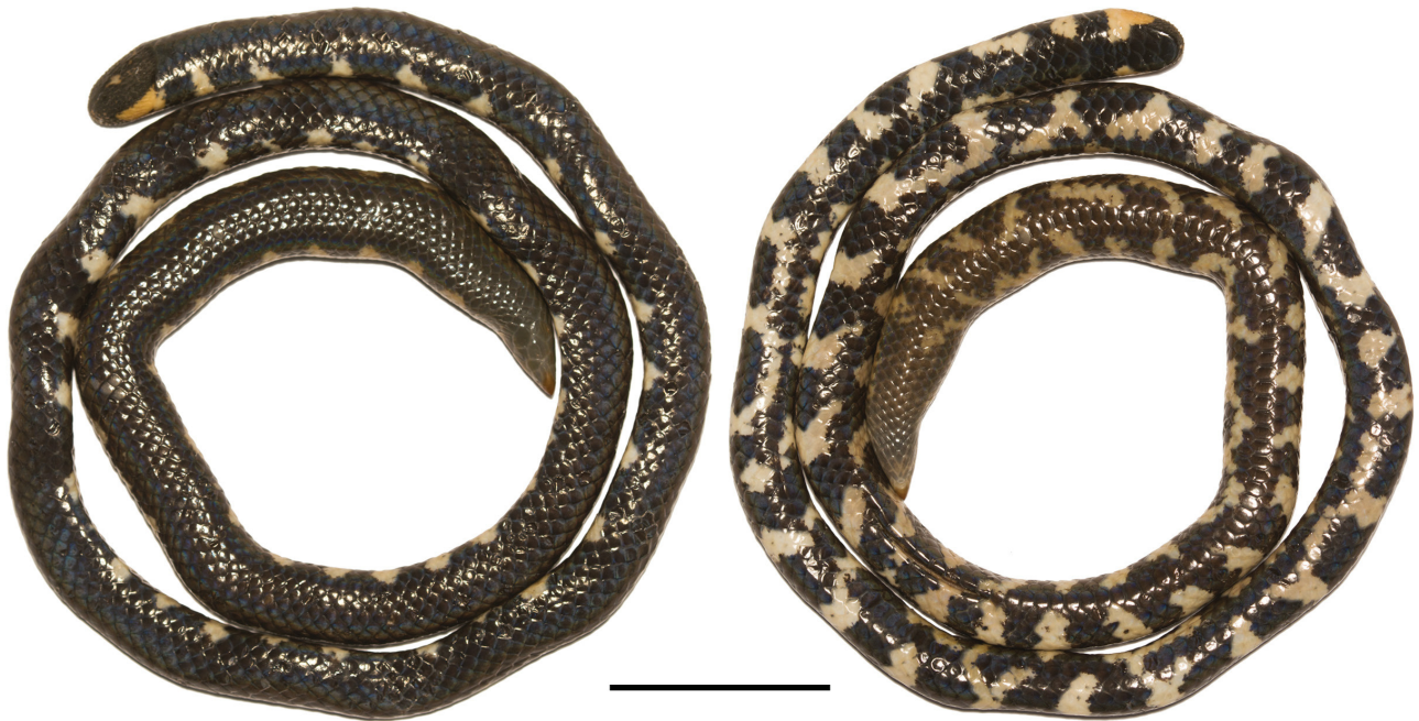
FIGURE 1. Dorsal and ventral view of the holotype (BNHS 3534) of Rhinophis melanoleucus sp. nov. Scale bar 25 mm.