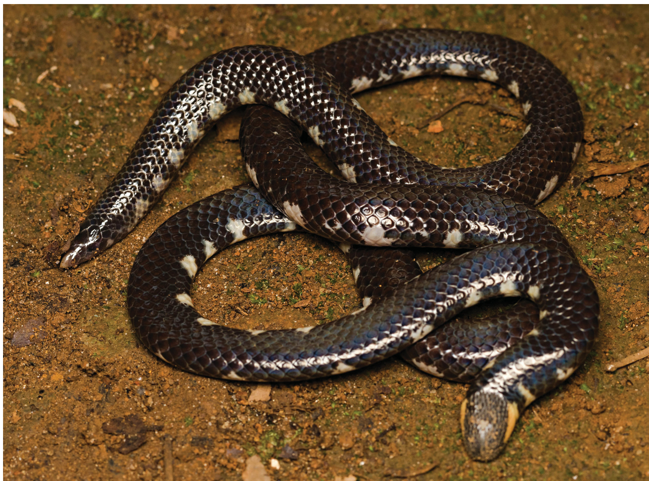
FIGURE 3. Holotype (BNHS 3534: total preserved length 461 mm) of Rhinophis melanoleucus sp. nov. in life.

Colour in life (Fig. 3). Dorsal surface uniformly glossy blackish and somewhat iridescent. Lateral and ventral pale blotches on body whitish, more purely so on mid and posterior of body than anteriorly (where whitish scales appear translucent so that darker spots beneath scales slightly visible). Head scales blackish except for paler, orange-brownish rostral and whitish lower and/or posterior parts of supralabials. Ventral surface of tail blackish except for whitish ventrolateral markings. Pale elongate markings on tail shield pale orange, paler and more whitish anteriorly than posteriorly.