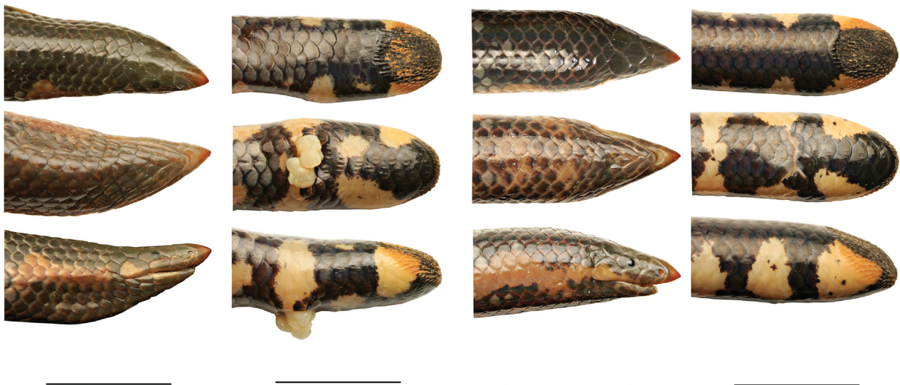
FIGURE 6. Heads and tails of two (of six) paratypes of Rhinophis melanoleucus sp. nov. Two left columns are BNHS 3537, two right columns BNHS 3538. Shown in dorsal (upper row), ventral (middle row) and lateral (lower row) views. Lateral views are of right (head) and left (tail) sides. Scale bars 10 mm.

Sexual dimorphism. There is no clear evidence of sexual dimorphism in number of ventral scales in the types, with the three females having 225–235 and three males having 218–236 (Table 1). Males tend to have proportionately slightly longer tails (2.6–3.5 % of total length) than females (2.3–2.8 %) and have more subcaudals (7,7 or 8,8) than females (6,6 or 6,7). Both females and males have ridges on scales on the underside of the tail and posteriormost part of the body, but these are more prominent in males.