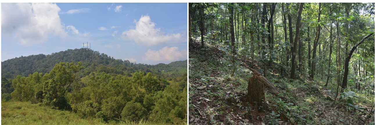
FIGURE 7. Habitat in the vicinity of Lakkidi, Wayanad district, Kerala, India, the type locality of Rhinophis melanoleucus sp. nov. Left photograph shows general habitat of upland moist forest and grassland, right photograph shows floor of forest where R. melanoleucus have been found.