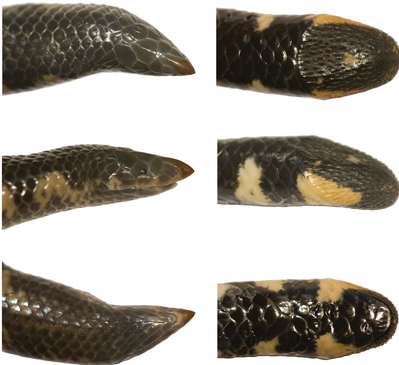
FIGURE 2. Views of the head (left) and tail (right) of the holotype (BNHS 3534) of Rhinophis melanoleucus sp. nov. , shown in dorsal (upper), lateral (middle) and ventral (lower) views. Not to same scale; see Table 1 for size of specimen.

Dorsal scale rows (i.e., excluding subcaudals) 15 at level of first subcaudals. Paired anal scales (right overlying left) considerably larger than posteriormost ventrals and subcaudals. Distal margin of each anal overlaps four (left) and three (right) small scales in addition to anteriormost subcaudals. Six subcaudals on each side, the posteriormost undivided. Some scales at posterior end of specimen bear low, short parallel ridges, towards posterior edges—on last few ventrals, small scales overlapped by anals, lower two or three dorsal scale rows of posterior of body and