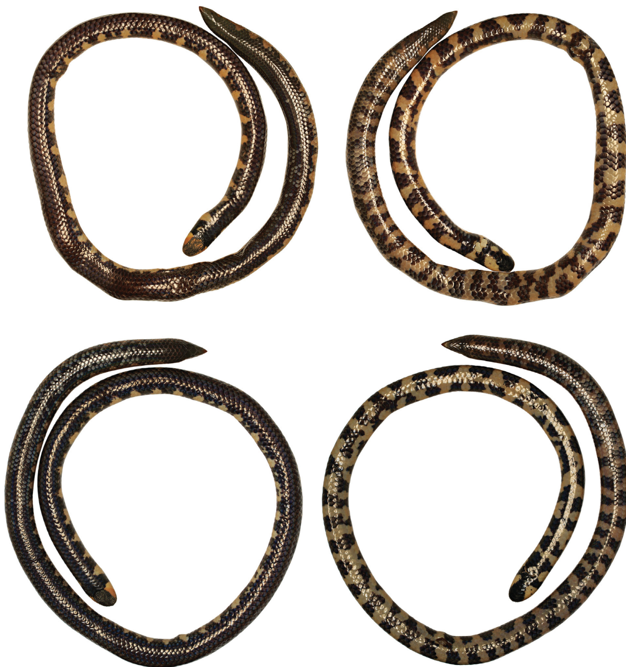
FIGURE 5. Two (of six) paratypes of Rhinophis melanoleucus sp. nov. Upper row BNHS 3537, lower row BNHS 3538; left column dorsal view, right column ventral view. Not to same scale; total length of BNHS 3537 303 mm, of BNHS 3538 357 mm.

(BNHS 3535, BNHS 3536, ZSI/WGRC/IR/V/3100). Rostral length from approximately 5 (ZSI/WGRC/IR/V/3100) to 14 (ZSI/WGRC/IR/V/3101) times distance between rostral and frontal. Eye diameter approximately 0.2–0.25 times length of ocular shield.