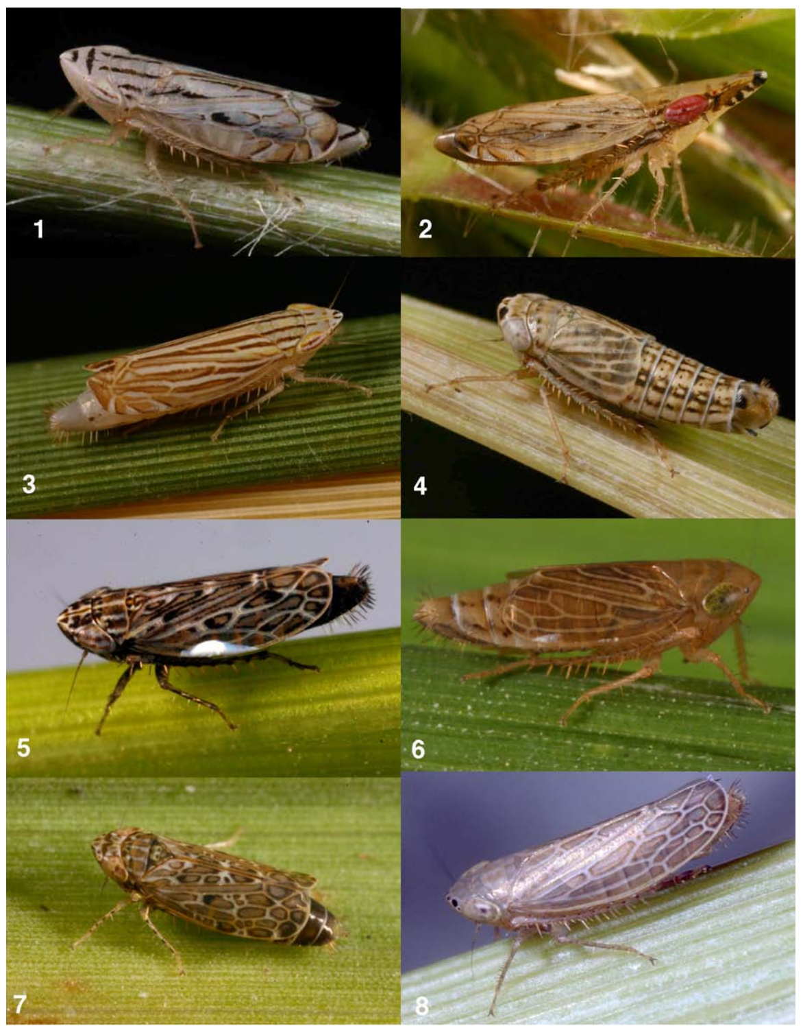
Figures 1-8. Some leafhopper species included on the Illinois list of SGNC and recorded in the present project: 1, Flexamia albida ; 2, Flexamia pyrops ; 3, Flexamia grammica ; 4, Athysanella incongrua (now listed as endangered in IL); 5, Rosenus cruciatus ; 6, Destria fumida ; 7, Polyamia herbida ; 8, Kansendria kansiensis (not recorded in IL prior to 1995; native to Kansas/Oklahoma and appears to be expanding its range).