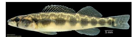
Stripeback Darter Percina notogramma Max size: 70 mm