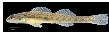
Johnny Darter Etheostoma nigrum Max size: 40 mm