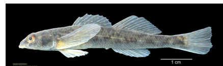
Glassy Darter Etheostoma vitreum Max size: 55 mm