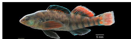
Rainbow Darter Etheostoma caeruleum Max size: 50 mm