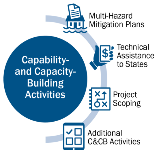
Figure 2: Capability-and Capacity-Building Activities

FEMA will select up to $60 million of C&CB activities which enhance the knowledge, skills, expertise, etc., of the current workforce to expand or improve the administration of flood mitigation assistance. In addition, C&CB activities may develop future Localized Flood Risk Reduction Projects and/or Individual Flood Mitigation Projects that will subsequently reduce flood claims against the National Flood Insurance Program.