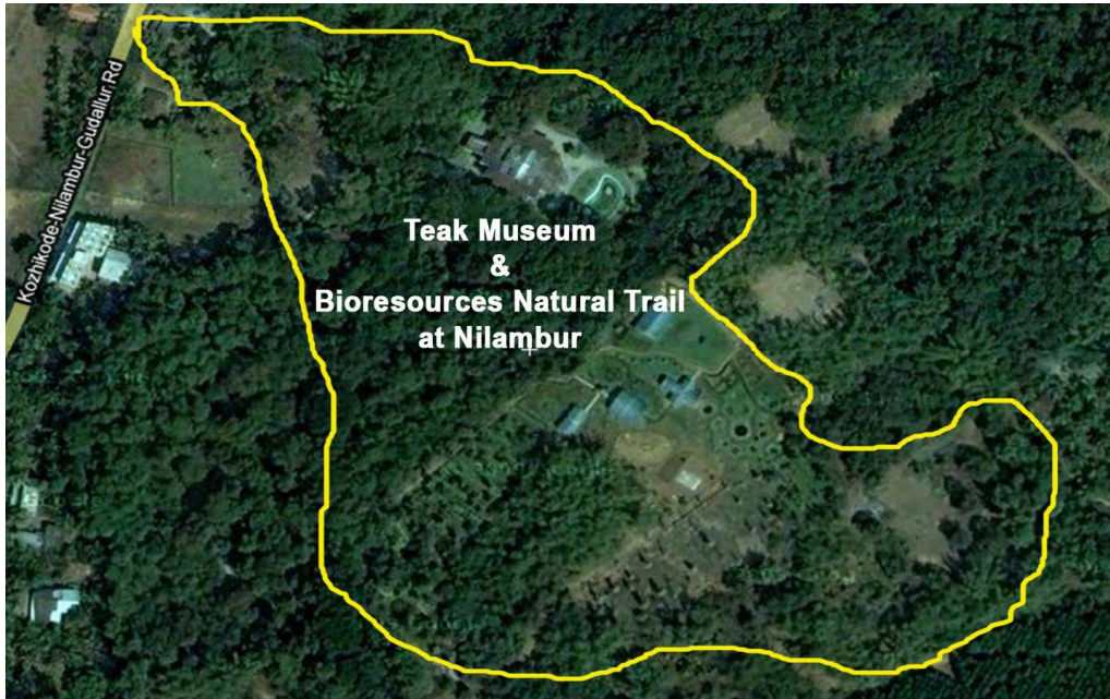
Figure 2. Imagery from Digital Globe Geo-eye showing the Teak Museum and Bioresources Nature Trail at Nilambur

The altitude of the KFR I Sub Centre campus is about 65 m above msl. The annual rainfall is around 2,360 mm, and it is during the month of July that the area receives the maximum precipitation of about 422 mm, whereas in January, February and March the precipitation is about 30.4 mm, 8.26 mm and 26.4 mm respectively. The mean maximum and minimum temperatures are 37 0 C and 17 0 C respectively. Surface soil is red (oxisol) fine loamy and the sub-surface soil is gravel and red sandy. During the dry period, the humidity is very less and herbs and shrubs tend to dry in the absence of subsoil moisture.