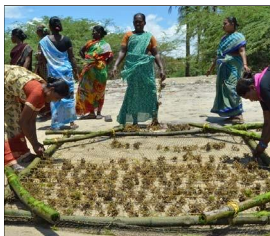
Tying Seedlings of Seaweed on a Bamboo Raft