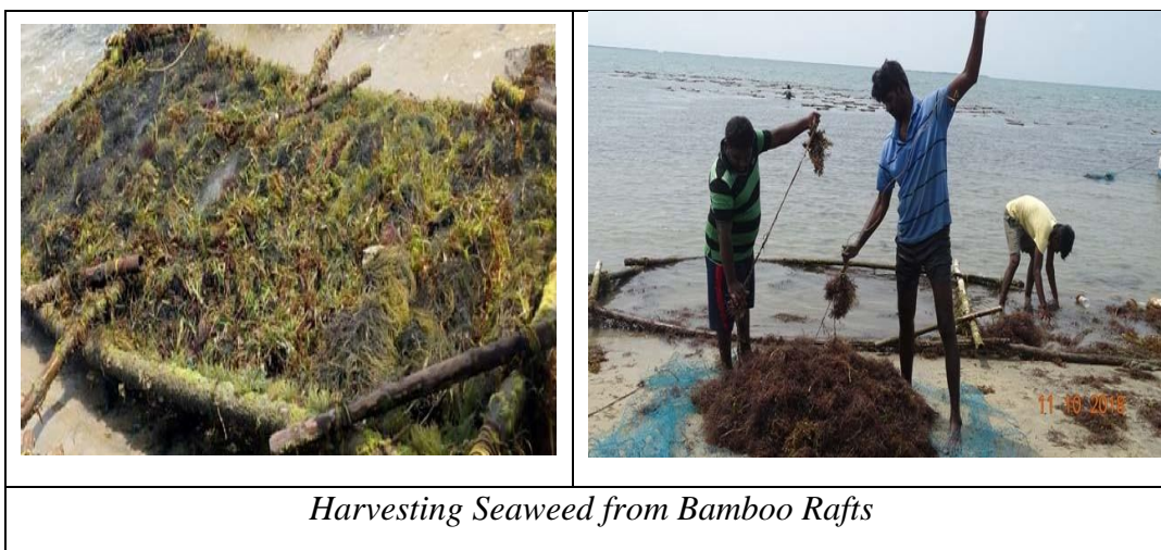
Harvesting Seaweed from Bamboo Rafts