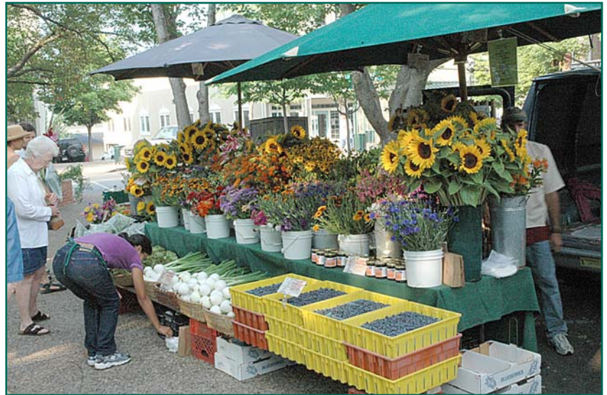
Farmers' Market.

On-farm marketing strategies include roadside or farm stands and pick-your-own arrangements. On-farm marketing strategies are often successful because pick-your-own customers who come for the enjoyment of spending time in the field will often also