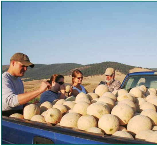
Tailgate marketing.

Tailgate marketing is one of the simplest forms of direct marketing. It involves parking a vehicle loaded with produce on a road or street with the hope that people will stop and purchase the produce. This is commonly used for selling in-season regional produce. This method takes very little investment and can be set up on short notice. Check with your city government first if you plan to set up inside a city. Some cities have regulations governing transient vendors.