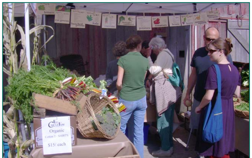
Farm stand.

Subscription marketing is a strategy that continues to gain interest and has benefited by the use of the Internet. Community supported agriculture (CSA) is one type of subscription marketing that involves providing subscribers with a weekly basket of seasonal produce, flowers or