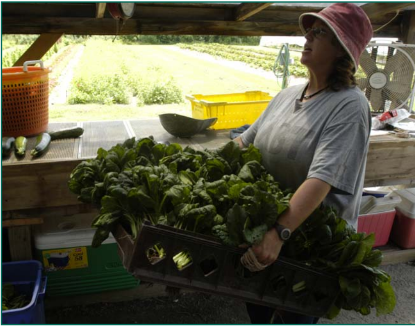
Community Supported Agriculture (CSA) Bivalve MD.

livestock products. The subscribers pay at the beginning of the season for part of or their entire share of the farmer's planned production. This eliminates the problem of covering up-front production costs at the beginning of the season and guarantees a market. The challenge for the grower is to have a consistent and continuous supply of popular vegetables throughout the growing season. It is helpful to survey the customers or members about their preferences before planting. Refer to ATTRA's publication Community Supported Agriculture for more information.