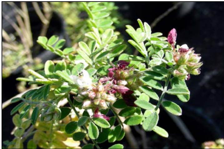
Dalea blooming at Fairchild's nursery 12/8/08

We have censused D. carthagenensis var. floridana at The Deering Estate and R. Hardy Matheson Preserve twice annually since fall 2003. When we conduct a census, we keep a tally of all seedlings that we see, although we are not conducting a seedling study in which we thoroughly search for and tag individual seedlings.